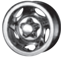
16" Polished Aluminum Wheel