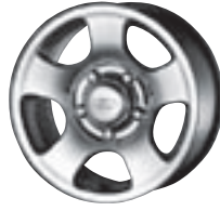
16" Cast Aluminum Wheel