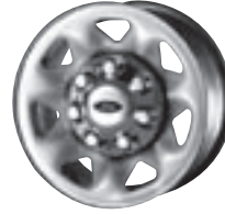
16" 7-Lug Gray Styled Steel Wheel