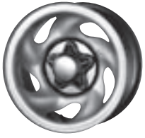
16" Styled Steel Wheel