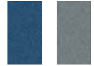
Norseia Blue Metallic Light Tundra Metallic