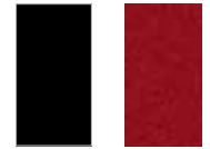
Black Vivid Red Metallic*