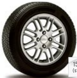
15" Multi-Spoke Alloy Wheels (standard on SES wagon; optional on S and SE; included with optional SE Sport Group)