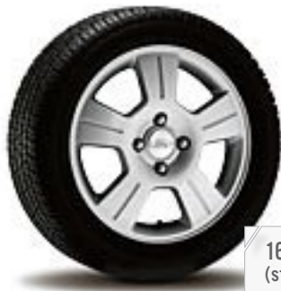
16" 5-Spoke Alloy Wheels (standard on SES sedan and hatchback)