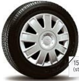
15" 9-Spoke Steel Wheels (standard on S models)