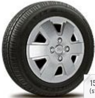
15" 6-Spoke Steel Wheels (standard on SE)