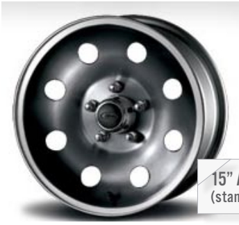
15" Alcoa Forged Aluminum Wheels (standard on FX4 Level II; optional on FX4 Off-Road)