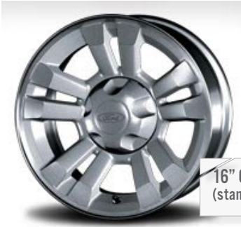
16" Cast Aluminum Wheels (standard on TREMOR 4x2 SuperCab; optional on SPORT 4x2 SuperCab)