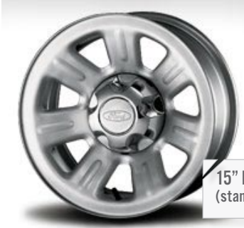
15" Painted Steel Wheels (standard on XLT and SPORT 4x2; XL 4x4)