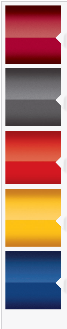
Redfire Clearcoat Metallic