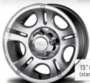
15" Cast Aluminum Wheels (standard on XLT)