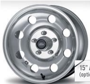
15" Alcoa Polished Forged Aluminum Wheels (optional on FX4 Off-Road and FX4 Level II)