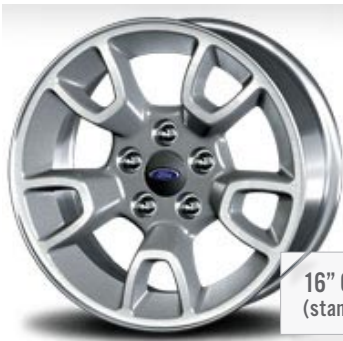
16" Cast Aluminum Wheels (standard on XLT SuperCab 4x4, SPORT/TREMOR and FX4 Off-Road)