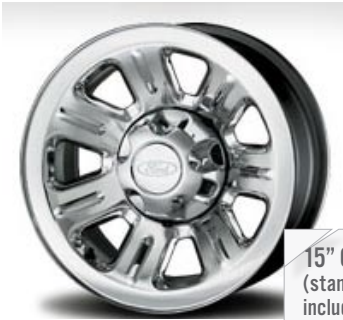
15" Chrome-Clad Steel Wheels (standard on XLT and SPORT Regular Cab 4x4; included in XLT 4x2 Appearance Package; optional on SPORT Regular Cab 4x2)