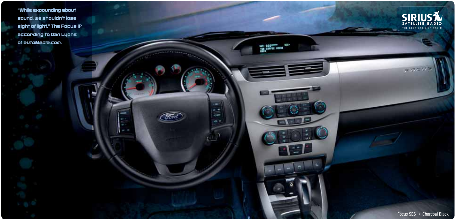
Focus SES • Charcoal Black