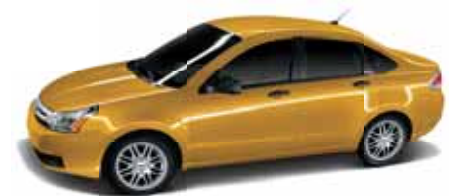
Amber Gold Metallic