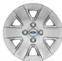
15" Wheel Cover Standard on S Sedan