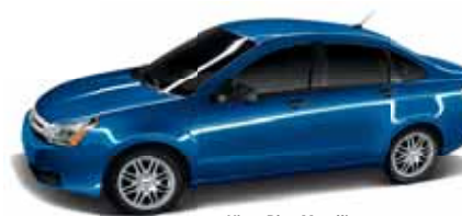
Vista Blue Metallic