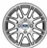
15" Aluminum-Alloy Standard on SE Sedan