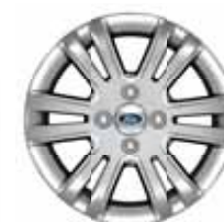
16" Euroflange Aluminum-Alloy Standard on SEL Sedan