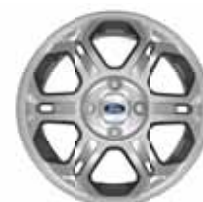
16" Aluminum-Alloy Standard on SE Coupe and SES Sedan