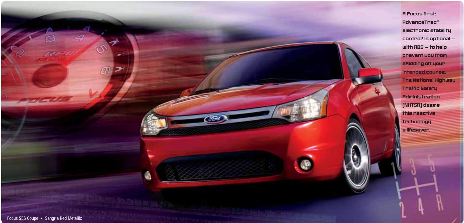
Focus SES Coupe • Sangria Red Metallic

A Focus first: AdvanceTrac® electronic stability control* is optional — with ABS — to help prevent you from skidding off your intended course. The National Highway Traffic Safety Administration [NHTSA] deems this reactive technology a lifesaver.