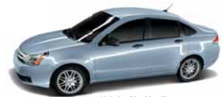
Light Ice Blue Metallic

Ford uses clearcoat paint for beauty and protection. Colors shown are representative only. Not all colors are available on all models. See your dealer for actual paint/trim options. Vehicles shown may contain optional equipment.