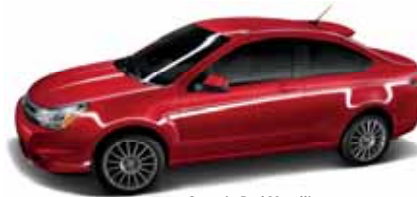
Sangria Red Metallic