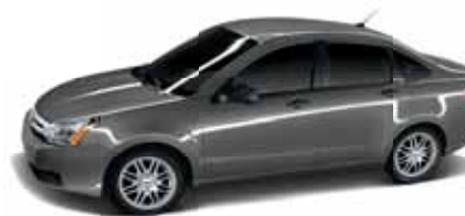
Sterling Grey Metallic