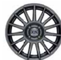
17" Premium Painted Dark Stainless Aluminum Standard on SES Coupe; Optional on SES Sedan