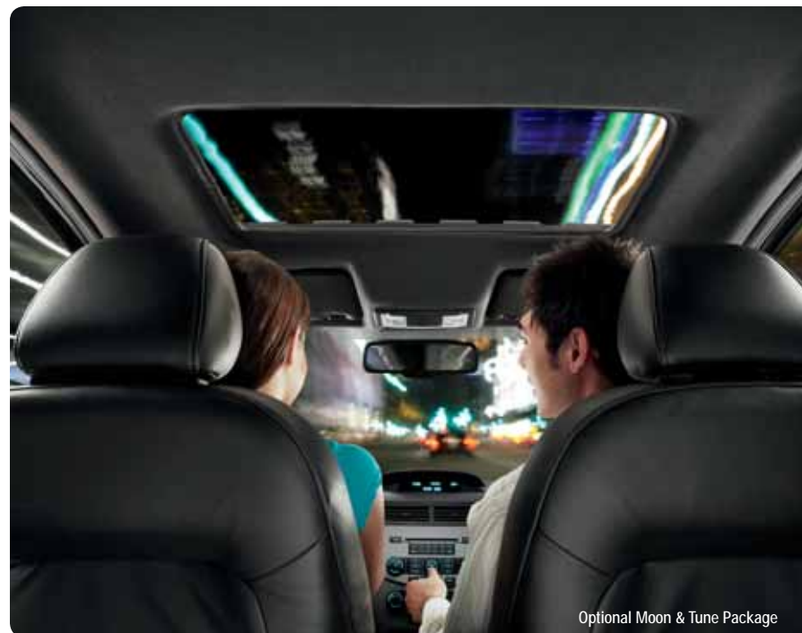
Optional Moon & Tune Package

Comparisons based on 2008 competitive models (Compact Car class), publicly available information and Ford certification data at time of release. Some features discussed may be optional. Vehicles shown may contain optional equipment. Features shown may be offered only in combination with other options or subject to additional ordering requirements or limitations. Dimensions shown may vary due to optional features and/or production variability. Following release of this PDF, certain changes in standard equipment, options and the like, or product delays may have occurred which would not be included in these pages. Your Ford Dealer is the best source for up-to-date information. Ford Division reserves the right to change product specifications at any time without incurring obligations.