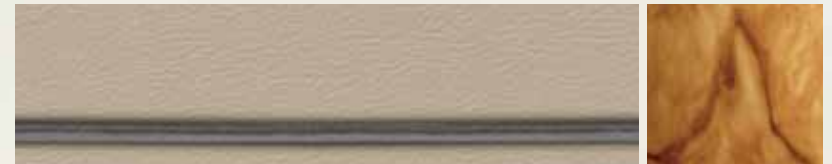
LIGHT CAMEL LEATHER WITH AGATE PIPING | OLIVE ASH WOOD

Available with all exterior colors except: Ingot Silver Metallic