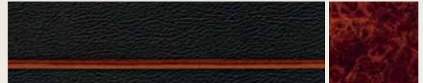
DARK CHARCOAL LEATHER WITH DARK RUST PIPING | WALNUT SWIRL WOOD

Available with all exterior colors except: Ingot Silver Metallic