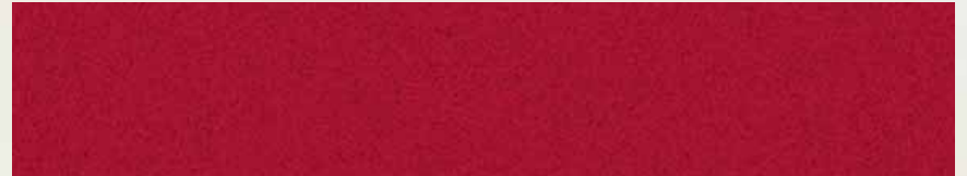
RED CANDY METALLIC TINTED CLEARCOAT 1,2