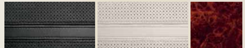
DARK CHARCOAL OR CASHMERE-COLORED LEATHER AND SEAM | WALNUT SWIRL WOOD

Executive Package Dark Charcoal trim is available with all exterior colors except: Steel Blue Metallic, Cinnamon Metallic Cashmere-colored trim is available with all exterior colors except: Steel Blue Metallic