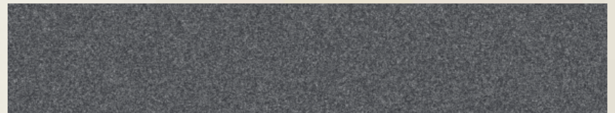
STERLING GRAY METALLIC