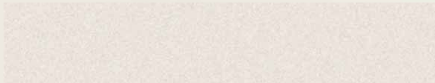
CRYSTAL CHAMPAGNE METALLIC TRI-COAT 1