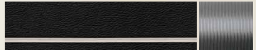
DARK CHARCOAL LEATHER AND SEAM WITH CASHMERE-COLORED PIPING | ALUMINUM TRIM

Sport Appearance Package available with all exterior colors except: Steel Blue Metallic, Cinnamon Metallic