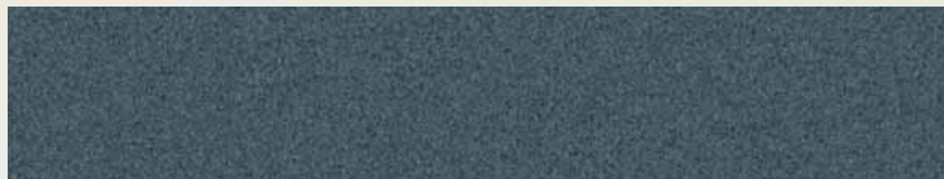
STEEL BLUE METALLIC