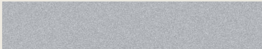
INGOT SILVER METALLIC