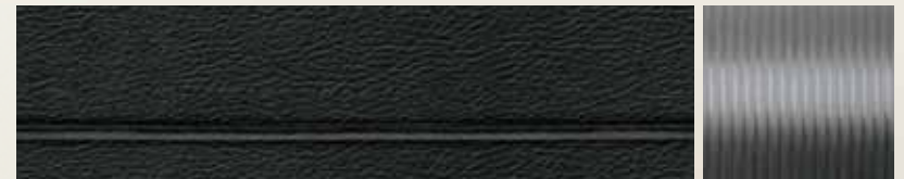
DARK CHARCOAL LEATHER WITH DARK CHARCOAL PIPING | ALUMINUM TRIM

Interior Aluminum Trim Package available with all exterior colors except: Steel Blue Metallic