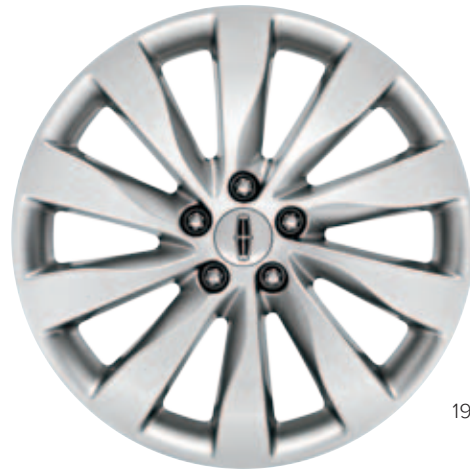
19" Premium Painted Aluminum Standard

Technology Package includes adaptive cruise control and collision warning with brake support, active park assist, and Lane-Keeping System 3