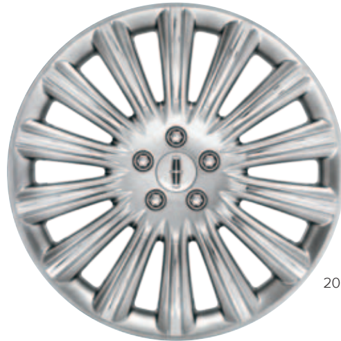
20" Premium Painted Aluminum with Chrome Inserts Available