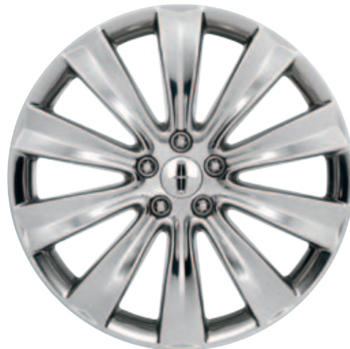
20" Polished Aluminum Standard on EcoBoost®