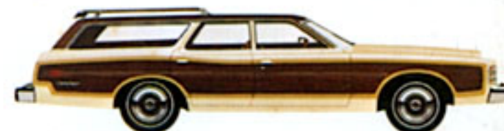
LTD Country Squire, Creme (6P), LTD Wagon also available.