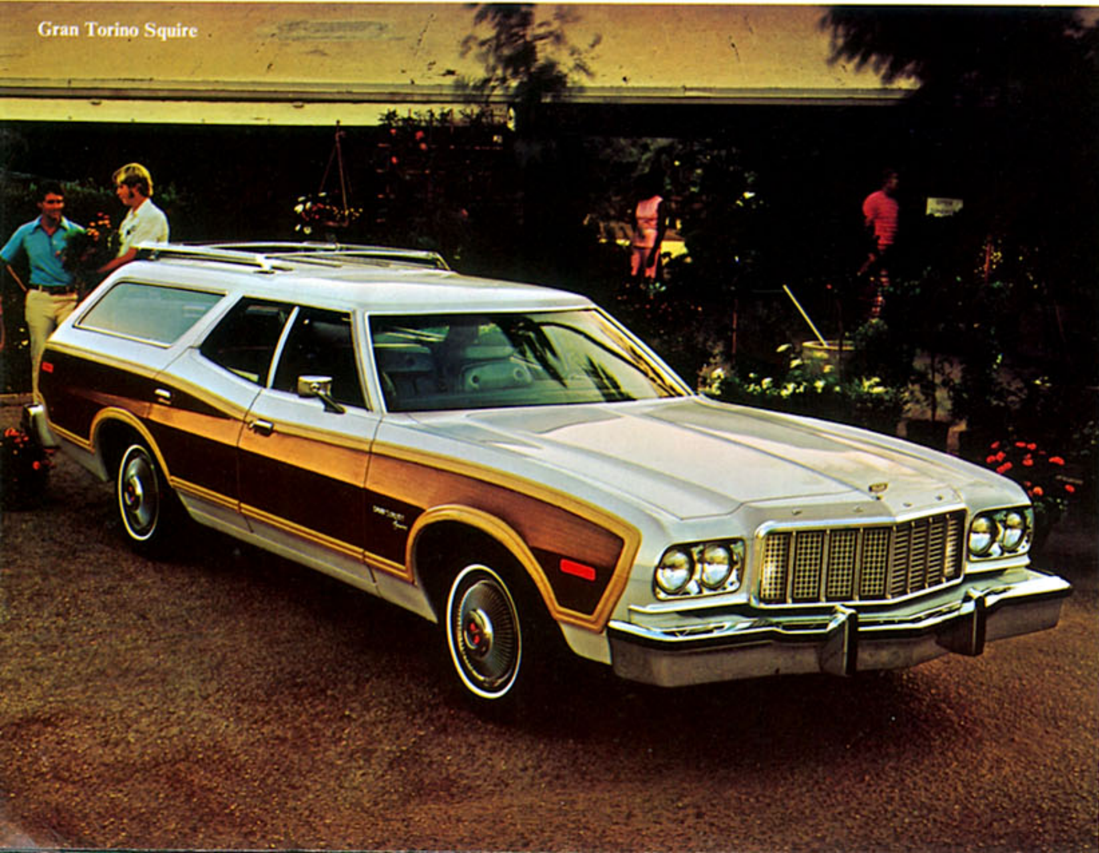
Gran Torino Squire

See the 1976 Ford Club Wagon catalog for more complete details on standard and optional equipment.