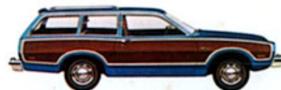
Pinto Wagon with Squire Option, Bright Blue Metallic (3E).