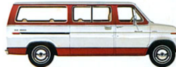
Chateau Club Wagon, Candyapple Red (T) and Wimbledon White (M), Club and Custom Club Wagons also available.