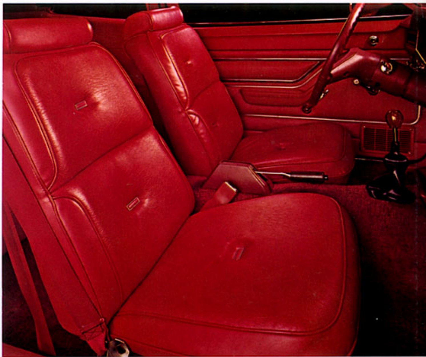
Pinto Wagon with Squire Option

Pinto Wagon with Squire Option , shown below, gives you Ford's classic "Squire" look, Pinto's famous frugal ways! Comes with woodgrain vinyl body paneling, Squire script, bright window frames, belt moldings and more. Red (2R).