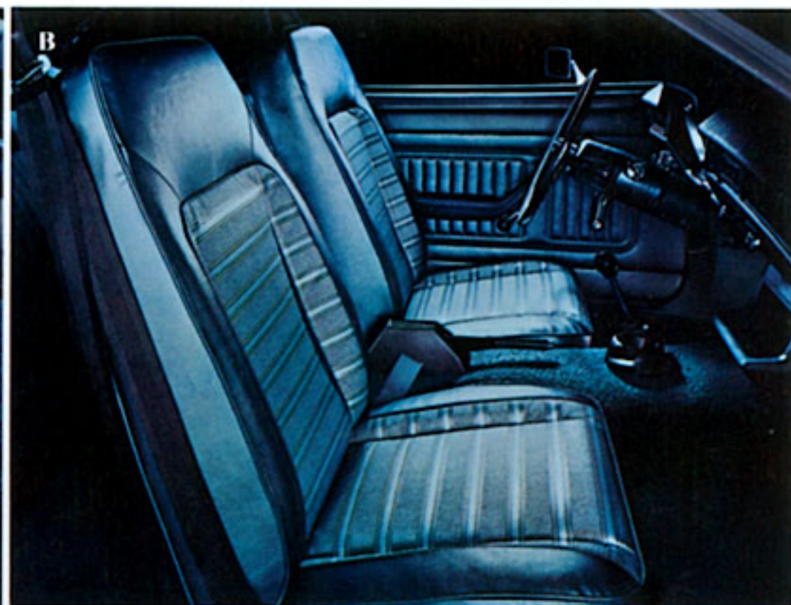
Pinto Wagon with Luxury Decor Group