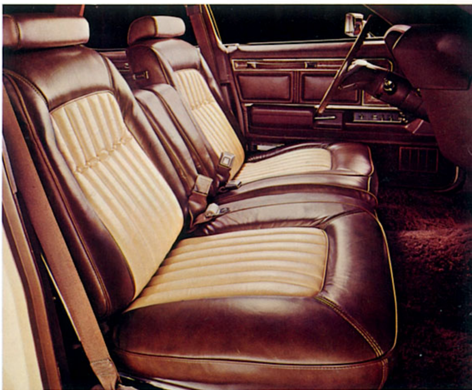
LTD Country Squire

LTD Country Squire , below, with color-keyed wheel covers, has rich woodlike vinyl bodyside paneling, unique front-end styling with hidden headlamps. Creme (6P).