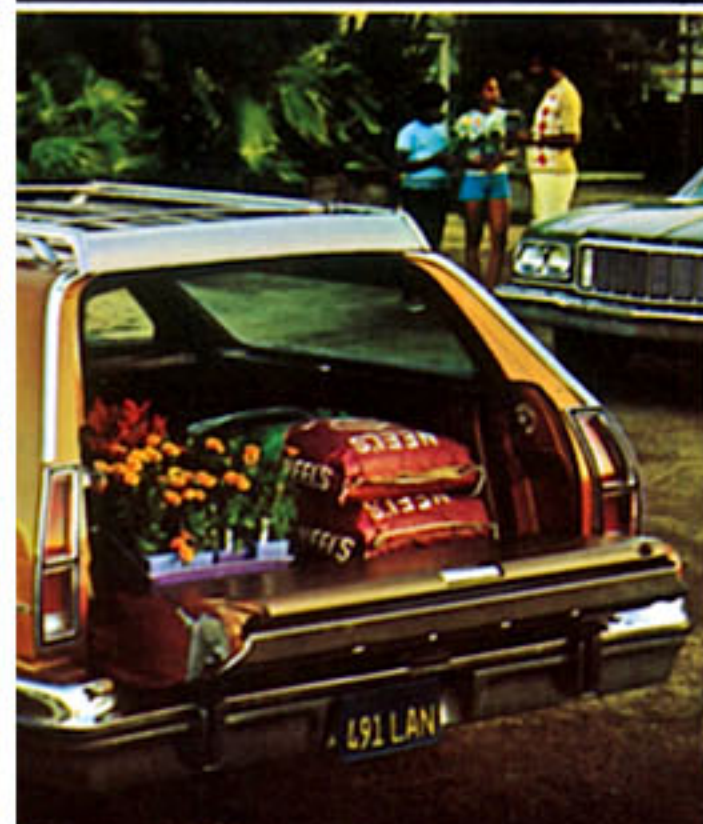
Chateau Club Wagon