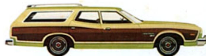
Gran Torino Squire, Green Glow (4T), Torino and Gran Torino Wagons also available.