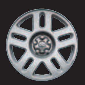
20-inch platinum-clad wheel (standard on Detonator)