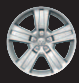
20-inch painted Satin Silver wheel (standard on Shock)