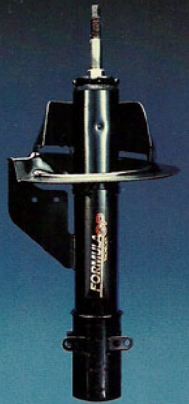
Monroe Formula GP gas charged struts and shocks.