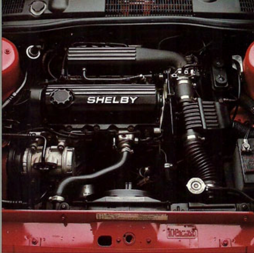
175 horsepower 2.2 liter turbo- charged, inter- cooled in-line 4 cylinder overhead cam engine with multi-point electronic fuel injection.