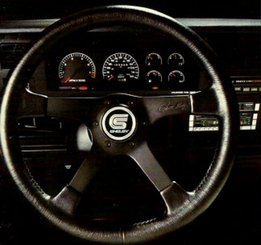
Shelby leather wrapped steering wheel, full analog instrumentation including voltage, oil pressure, fuel, temperature, tachometer and speedometer.