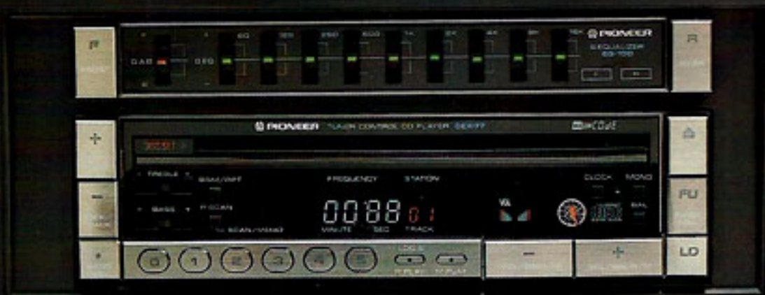
Pioneer DEX 77 120 watt compact disc with AM/FM stereo, 9-band graphic equalizer, 2 amps and 10 speakers.