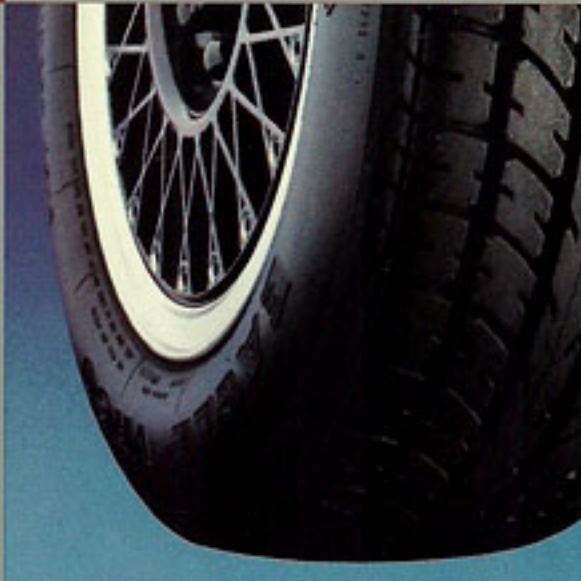
Goodyear Eagle 205/60VR15 Gatorbacks.