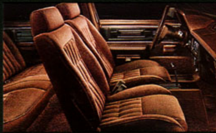
FIRENZA CRUISER INTERIOR.