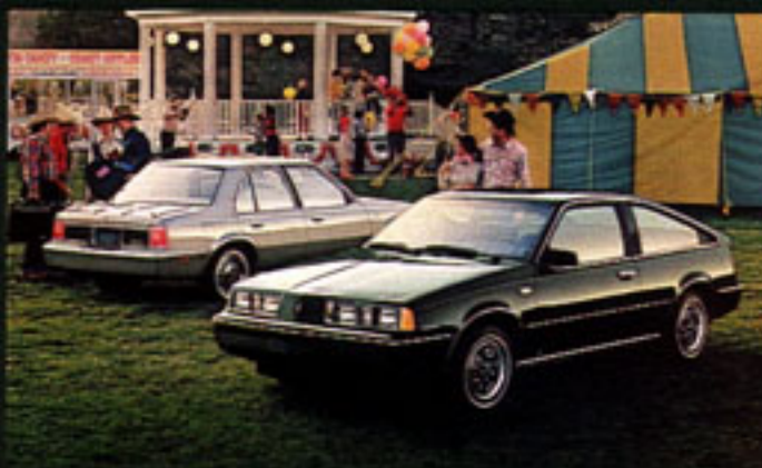
FIRENZA COUPE & SEDAN