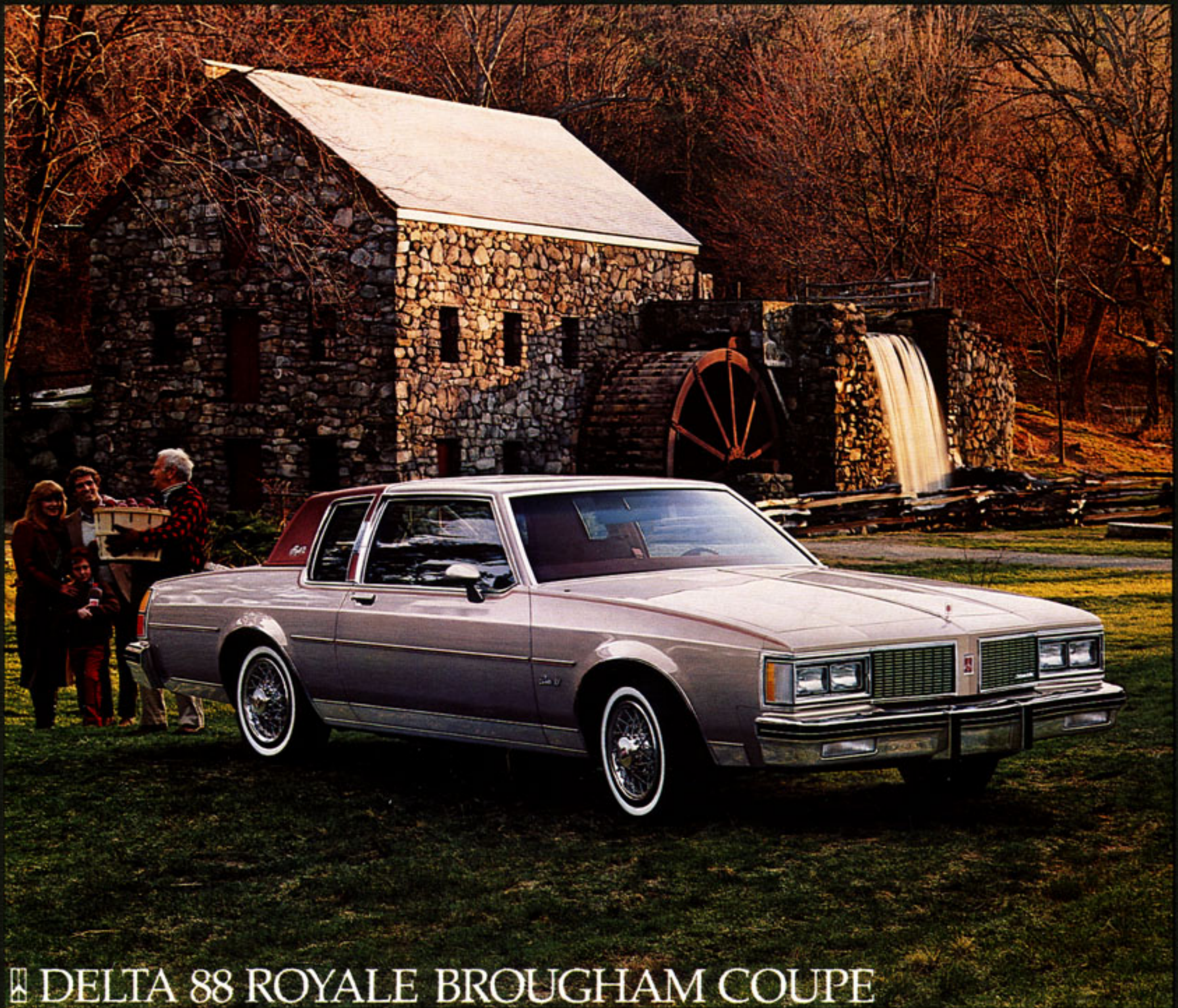
DELTA 88 ROYALE BROUGHAM COUPE