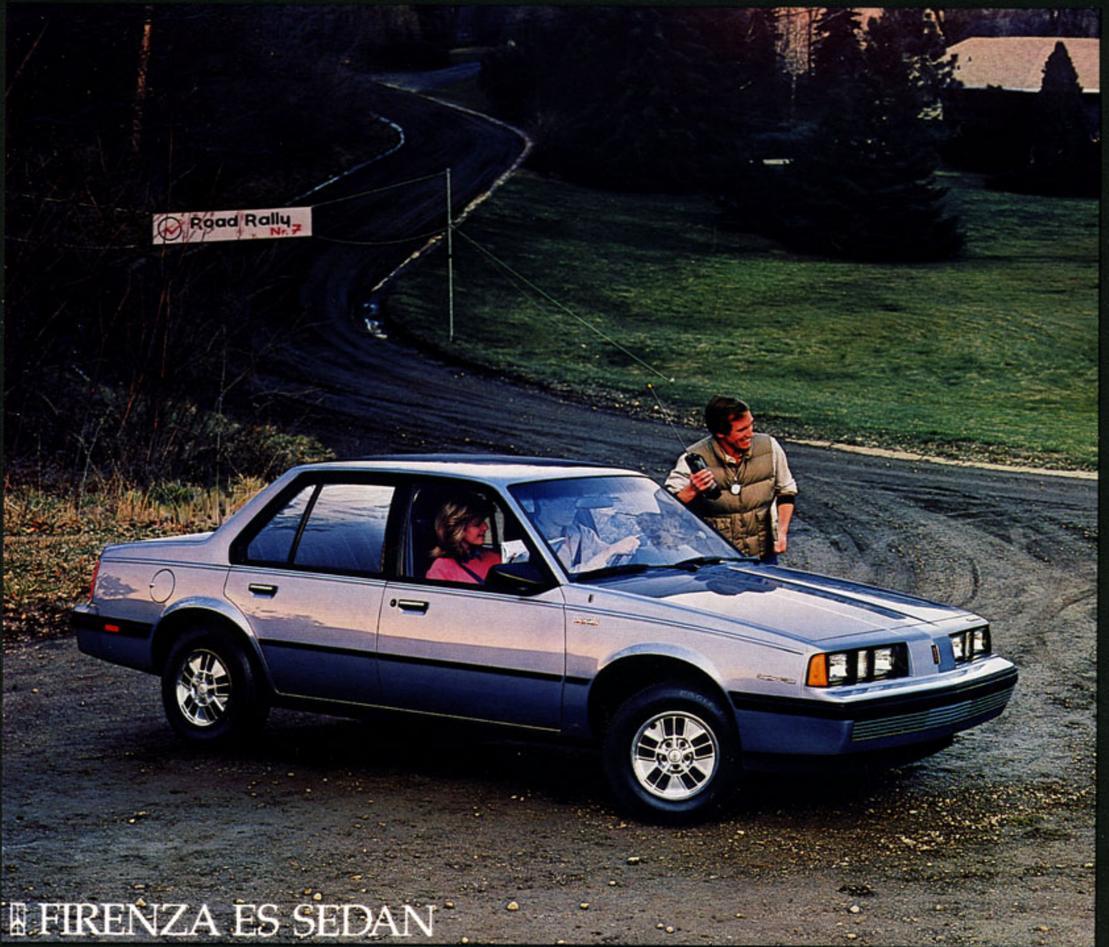
FIRENZA ES SEDAN

NOW THAT YOU'VE FOUND YOUR WAY TO FUN AND COMFORT... RELAX AND ENJOY IT. This is what a front-wheel-drive, grand-touring sedan can be when it's an Oldsmobile. Extra special—with black body side moldings and accent trim, special accent stripes, styled wheels and more. Under the hood, spirited engines that really know how to scramble. Like the optional 1.8-liter L4 electronic fuel injected overhead cam engine that you can team with the available 5-speed manual transmission. If you love driving, you've got to get your hands on this one.