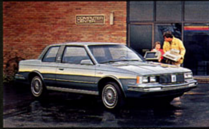
CUTLASS CIERA BROUGHAM COUPE

IT FEELS LIKE STEPPING INTO THE FUTURE—IN STYLE AND TECHNOLOGY. It's the most advanced front-wheel-drive, mid-size ever offered by Oldsmobile. Designed with the aid of computers, built and tested with robots and lasers, it is a high technology front-wheel-drive car that lives up to your most rigorous expectations. You can even order the available electronic instrumentation with analog graphs and digital readouts. Cutlass Ciera Brougham—latest edition in the Cutlass tradition. No wonder it's one of America's fastest-growing mid-size cars.