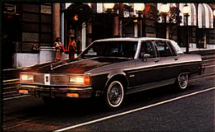
NINETY-EIGHT REGENCY SEDAN

YOU KNOW WHAT IT TAKES TO MAKE THINGS RIGHT. FOR YOU THE "THINKING MAN'S LUXURY CAR" MAKES SENSE. Sure, you like impressive lines, but what about the bottom line? Are you getting what you pay for? You like lavish interiors, but what about quality and solid engineering? Good performance, of course, but what about economy? The more you think about these things, the more a Ninety-Eight Regency makes sense. It's a logical luxury car choice. Why not get all the facts at your nearest Oldsmobile dealer?