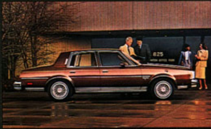
CUTLASS SUPREME BROUGHAM SEDAN

YOU KNOW FROM THE STYLE, GRACE AND UNEQUALLED TRACK RECORD THAT THIS IS A THOROUGHbred. Cutlass Supreme Brougham comes from classic stock—bred from a proud heritage of style and grace. And from a great winning tradition. In fact, over the last nine years, Cutlass Supreme has outsold every other mid-size car in America, regardless of price. Here's a contemporary classic with the look of a thoroughbred and the class of a champion. And you feel it—every time you take a ride. Plan to take a ride real soon.