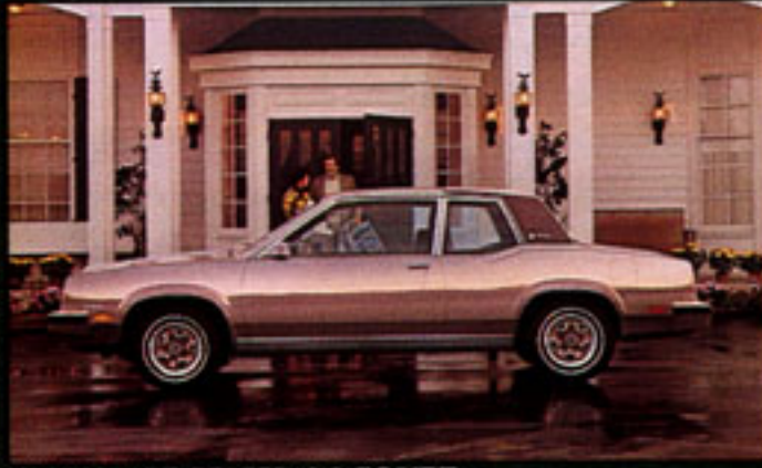
OMEGA BROUGHAM COUPE