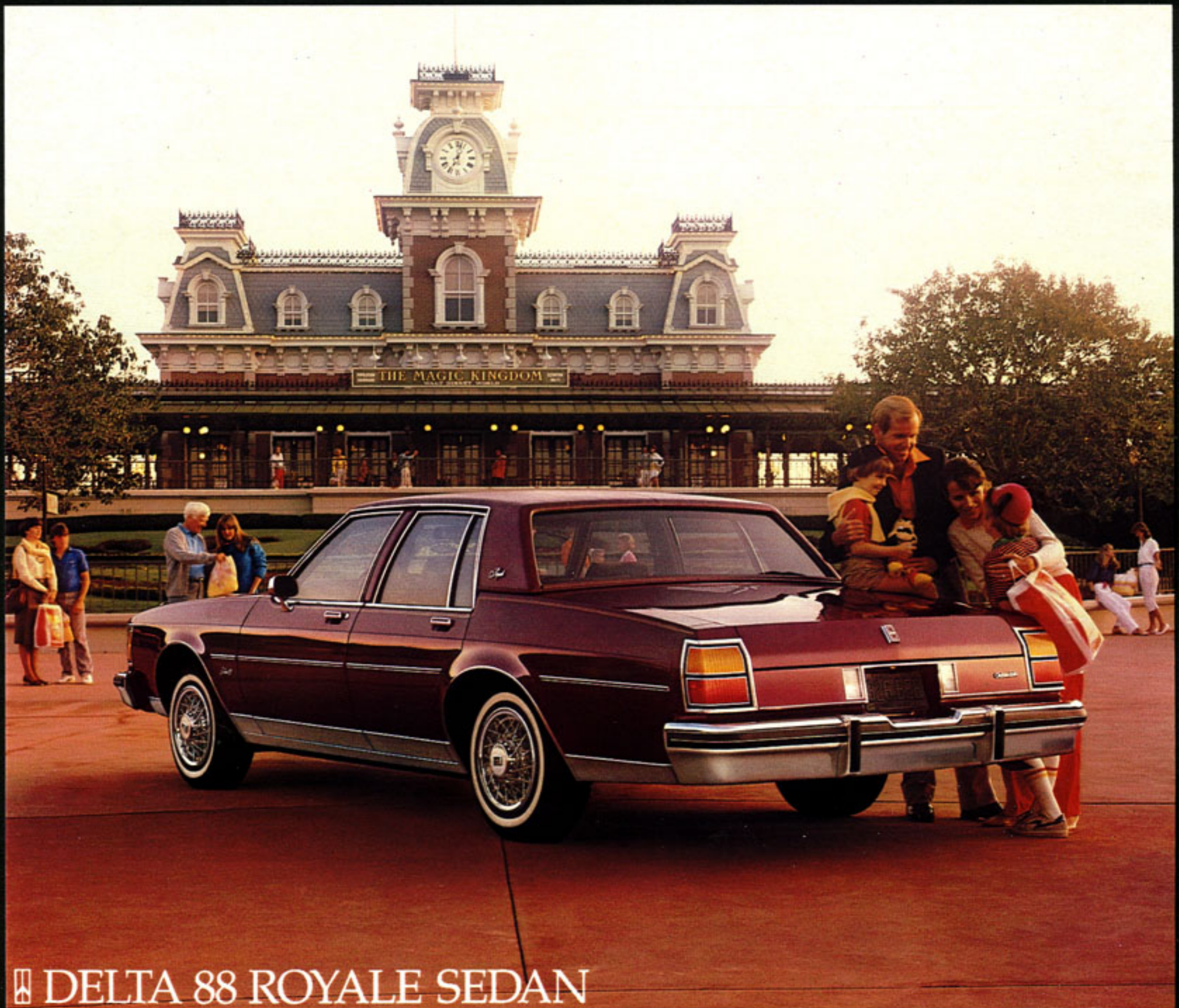
DELTA 88 ROYALE SEDAN