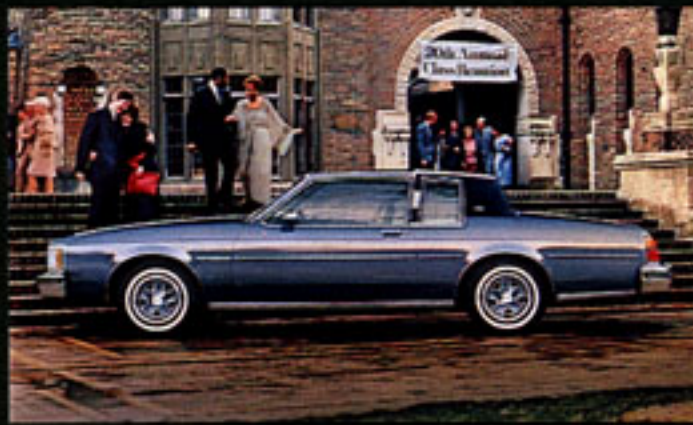
DELTA 88 ROYALE COUPE

AFTER LONG, BUSY DAYS, YOU APPRECIATE THE COMFORT OF A SMOOTH, QUIET FAMILY CAR. A trip to Disney World. Or a visit to Grandma's house. At the end of the day with a long ride ahead, everyone looks forward to the comfort of the Delta 88 Royale. Those full-foam seats are just the ticket for tired bodies. So is the gentle action of the Pliacel shock absorbers and the coil spring suspension. Extensive sound-absorbing materials add to the quiet and relaxing comfort. The value is comforting, too, and so is Delta 88 Royal's affordable price.