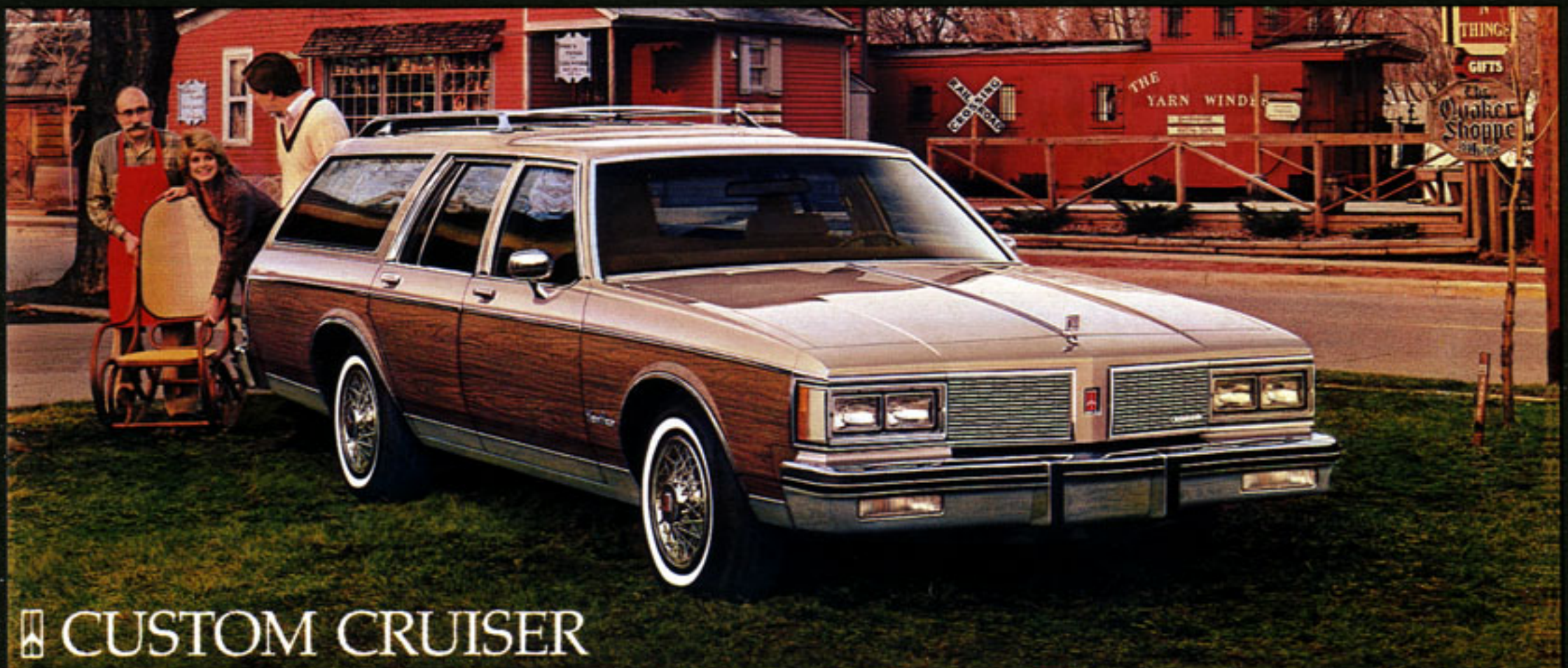
▣ CUSTOM CRUISER

GET THE WAGON CAPACITY YOU WANT WITH ELEGANT CUSTOM OR SPORTY FIRENZA CRUISER. Custom Cruiser is famous for doing the work and the town with the same elegant flair. It has 87.2 cubic feet of cargo space with second seat down. And up front full-foam seats with rich velour fabrics (or glove-soft vinyl). Like it sporty? Try Olds Firenza Cruiser. You'll take to it as naturally as it takes to the road. Inside, with back seat folded down, 63.4 cubic feet of carpeted cargo area. Plus, both wagons offer a choice of available engines. Go cruising . . . Olds style.