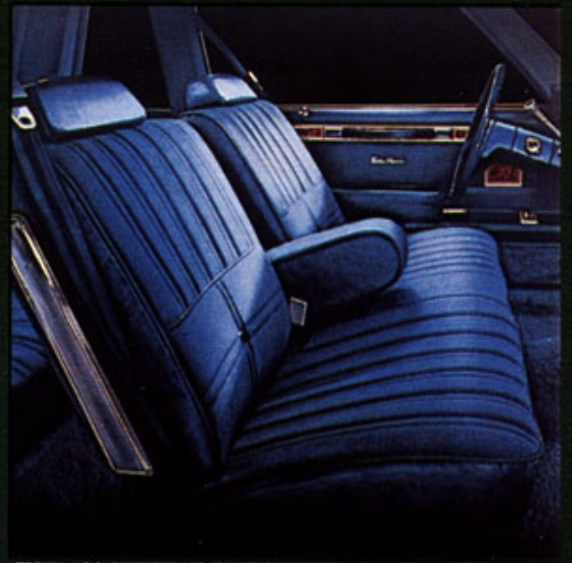
CUTLASS SUPREME INTERIOR

IT'S ALL HERE. THE STYLE. THE ELEGANCE. THE TRADITION. ALL AT A PRICE THAT MAKES THEM ALL THE MORE ENJOYABLE. Every Cutlass has its own way to win you over. With Cutlass Supreme Coupe and Sedan, it just might be affordability. Because, for all their elegance, they offer the easiest ways of all to enjoy the style, quality and value of a Supreme. With prices as attractive as the cars themselves, it's very easy to see why Cutlass Supremes are the most popular Oldsmobiles—ever. Take a test drive—and get that Supreme feeling.