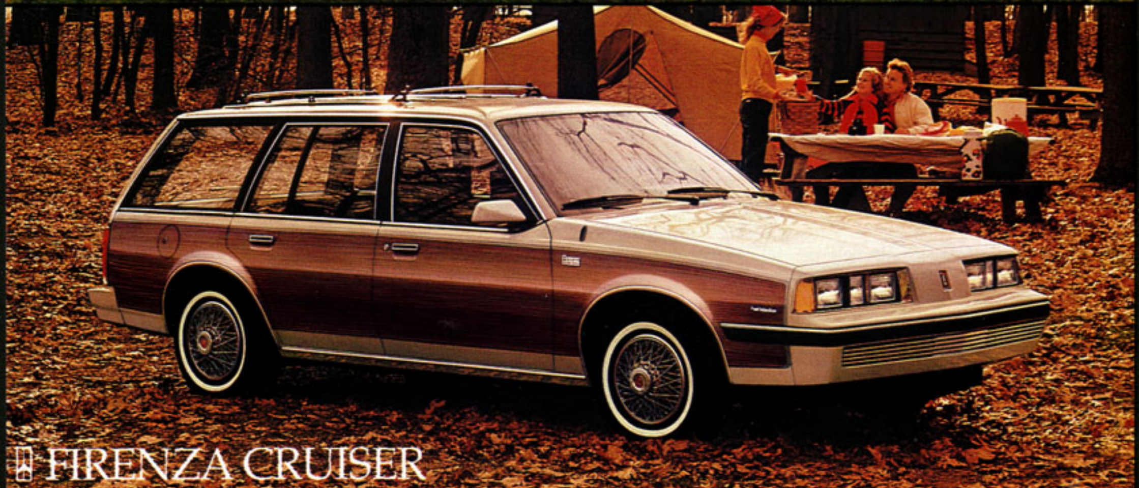
▣ FIRENZA CRUISER