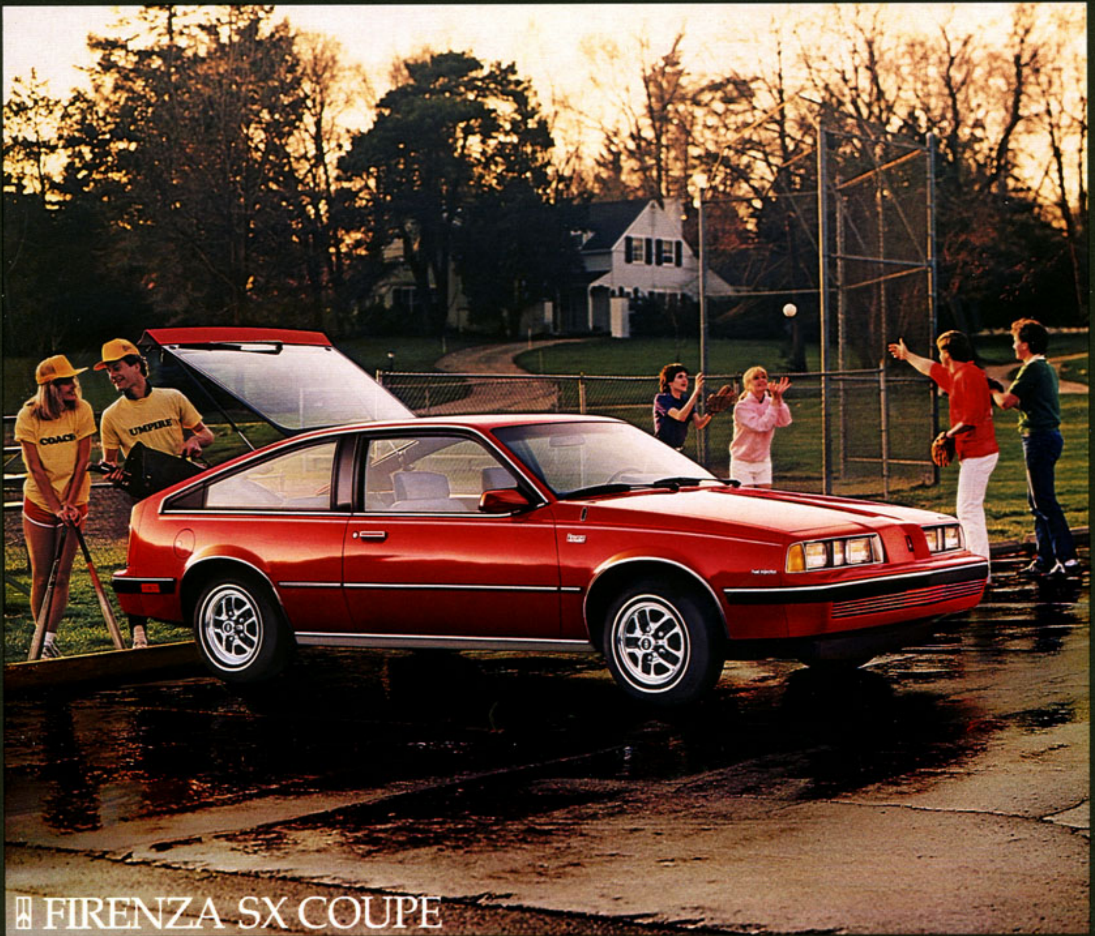
FIRENZA SX COUPE