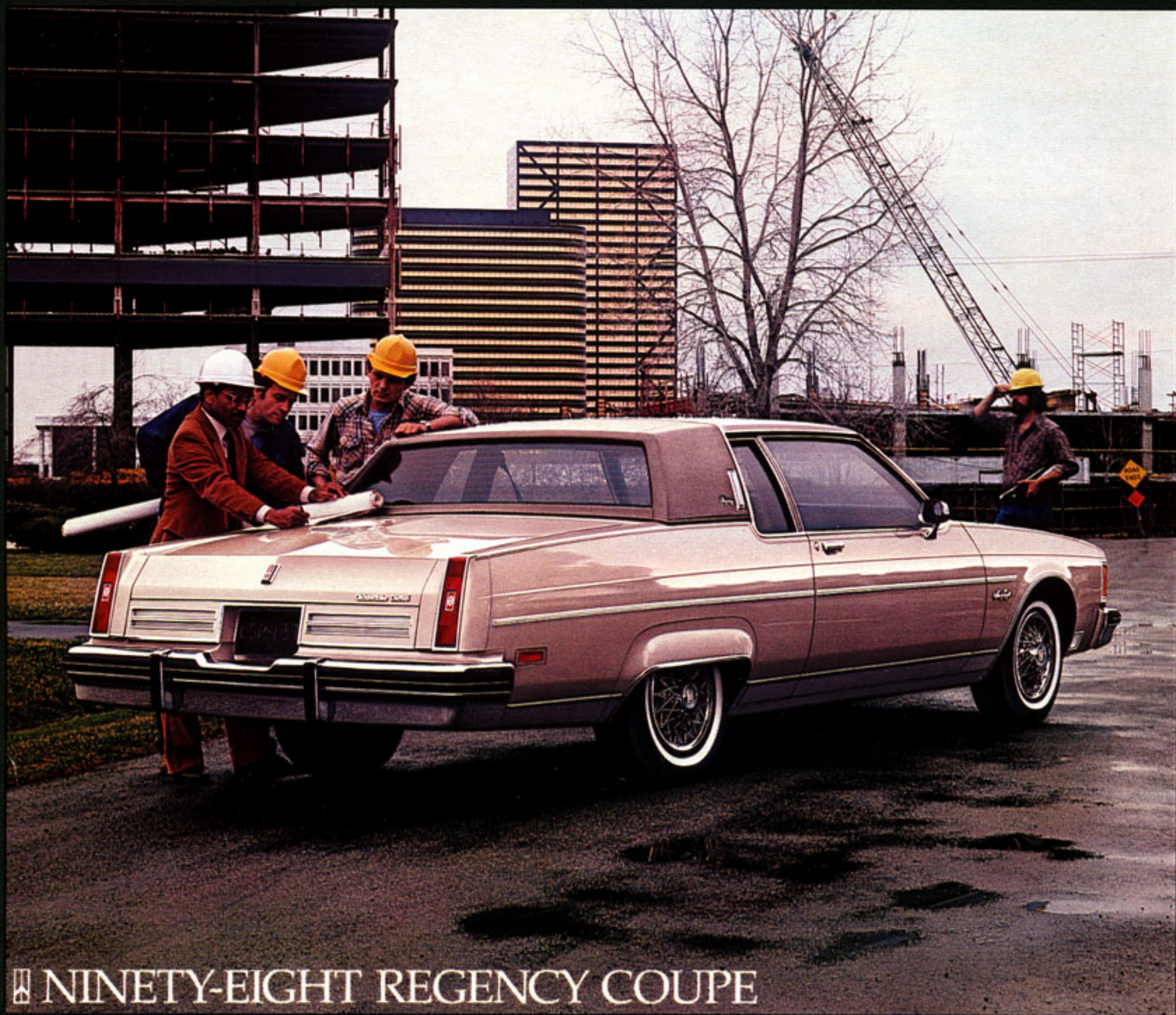
▣ NINETY-EIGHT REGENCY COUPE