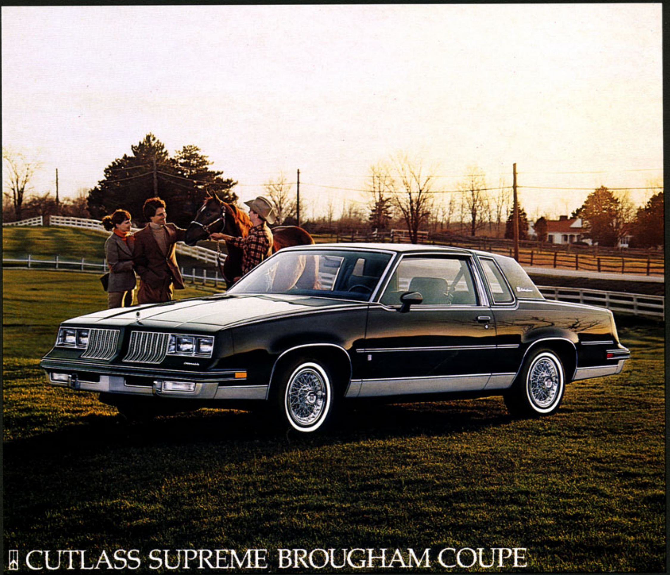
▣ CUTLASS SUPREME BROUGHAM COUPE