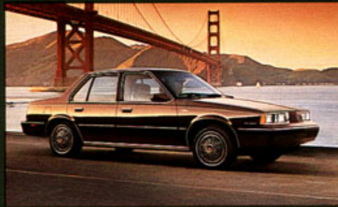
FIRENZA LX SEDAN

THIS SPORTY FUN-TO-DRIVE CAR NEEDS NO COACHING WHEN IT COMES TO HAVING A GOOD TIME. From the first feel of the wheel, you'll perceive a special kind of excitement that Firenza SX brings to the road. Feel the steady power of its standard 2.0-liter electronic fuel injected engine, or available 1.8-liter overhead cam engine, also with electronic fuel injection. Feel the precision of its 4 on the floor or available 5-speed manual transmission...and you've just shifted one step further along the road to driving enjoyment.