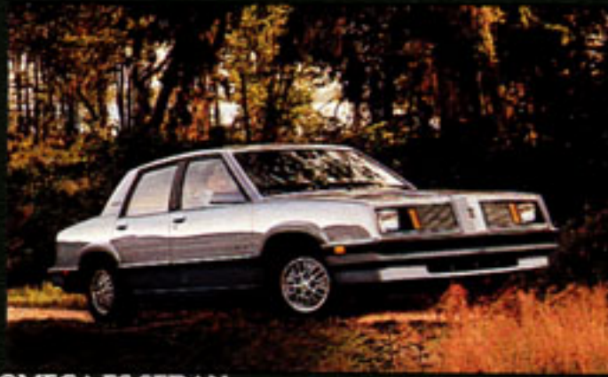
OMEGA ES SEDAN

WHEN IT'S COMFORTABLE ON THE ONE HAND, AND AFFORDABLE ON THE OTHER, IT MAKES FOR A GREAT MATCH. Choose either front-wheel-drive Omega Coupe or Sedan and get a level of comfort and quality that's strictly Oldsmobile. Little things that mean a lot like: Olds Omega's comfortable custom bench seating with full-foam and fold-down center armrest, plus fuel efficient 2.5-liter L4 electronic fuel injected engine. Comfortable on the one hand, affordable on the other; it's been an Olds Omega hallmark for years.