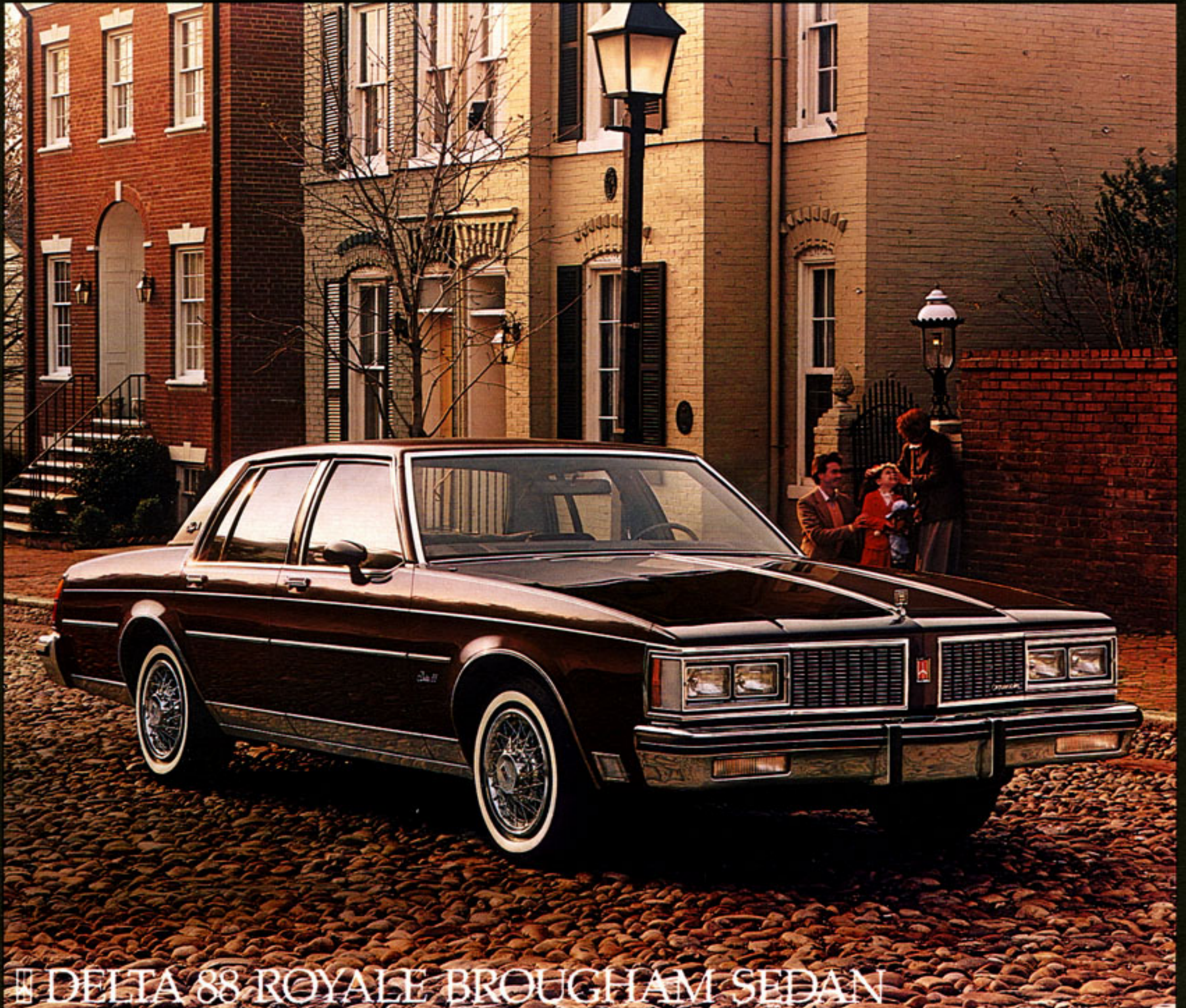
■ DELTA 88 ROYALE BROUGHAM SEDAN