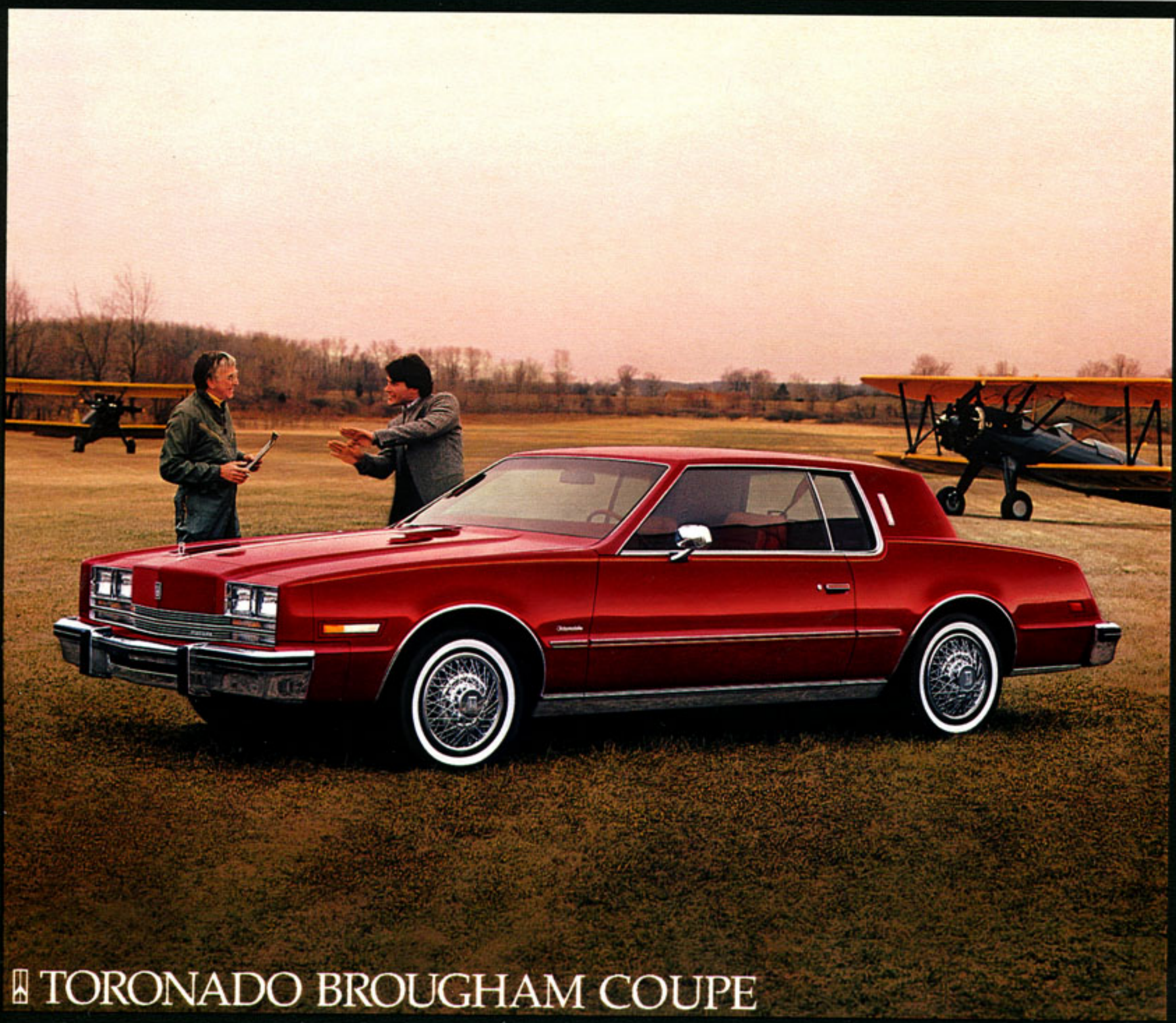
▣ TORONADO BROUGHAM COUPE