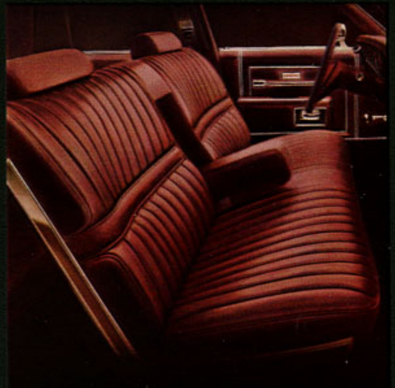
CUSTOM CRUISER INTERIOR.

GET THE WAGON CAPACITY YOU WANT WITH ELEGANT CUSTOM OR SPORTY FIRENZA CRUISER. Custom Cruiser is famous for doing the work and the town with the same elegant flair. It has 87.2 cubic feet of cargo space with second seat down. And up front full-foam seats with rich velour fabrics (or glove-soft vinyl). Like it sporty? Try Olds Firenza Cruiser. You'll take to it as naturally as it takes to the road. Inside, with back seat folded down, 63.4 cubic feet of carpeted cargo area. Plus, both wagons offer a choice of available engines. Go cruising . . . Olds style.