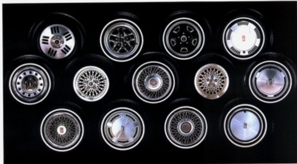
Top row left to right:

Aluminum-Styled Wheels. Available on all Firenza, Calais and Calais Supreme models, except GT.