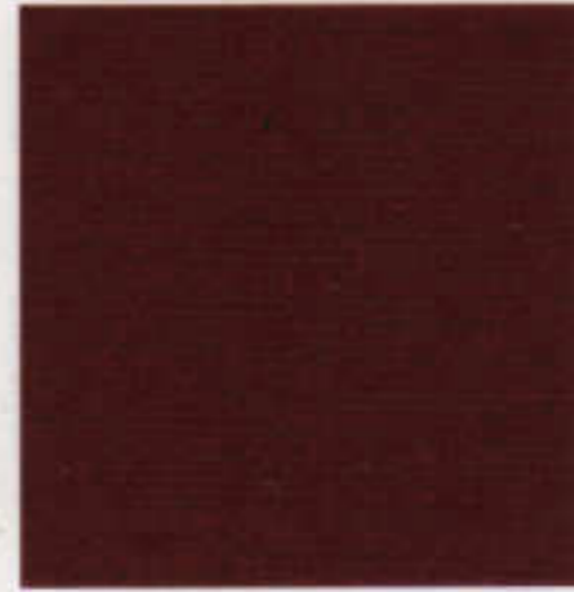
Ruby Red Metallic (72)*