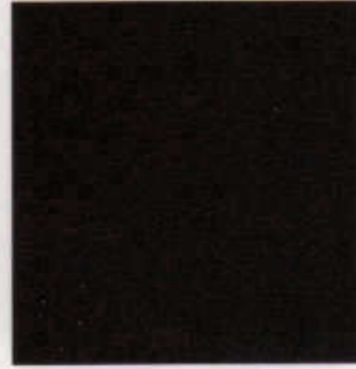
Dark Cherry Metallic (77)