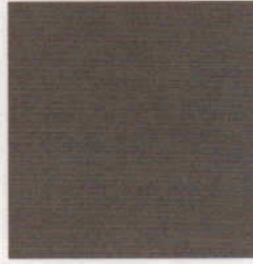
Platinum Gray Metallic (03)*