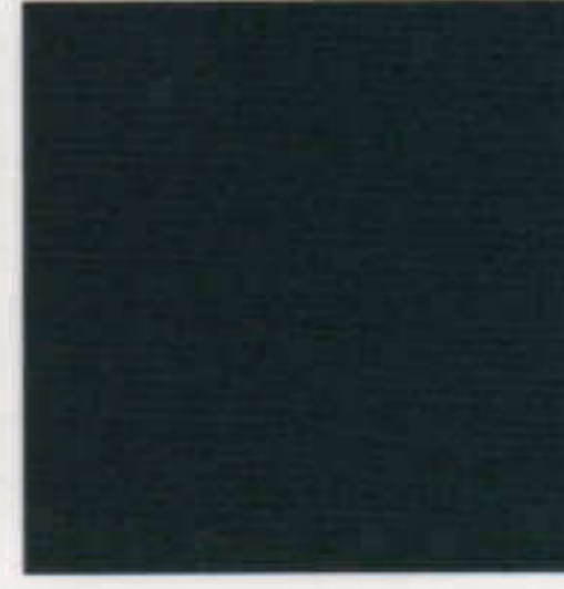
Dark Jadestone Metallic (18)