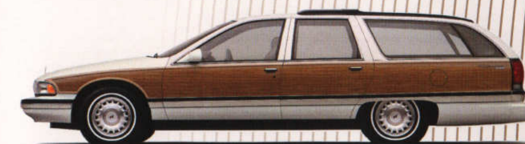
Roadmaster Estate Wagon