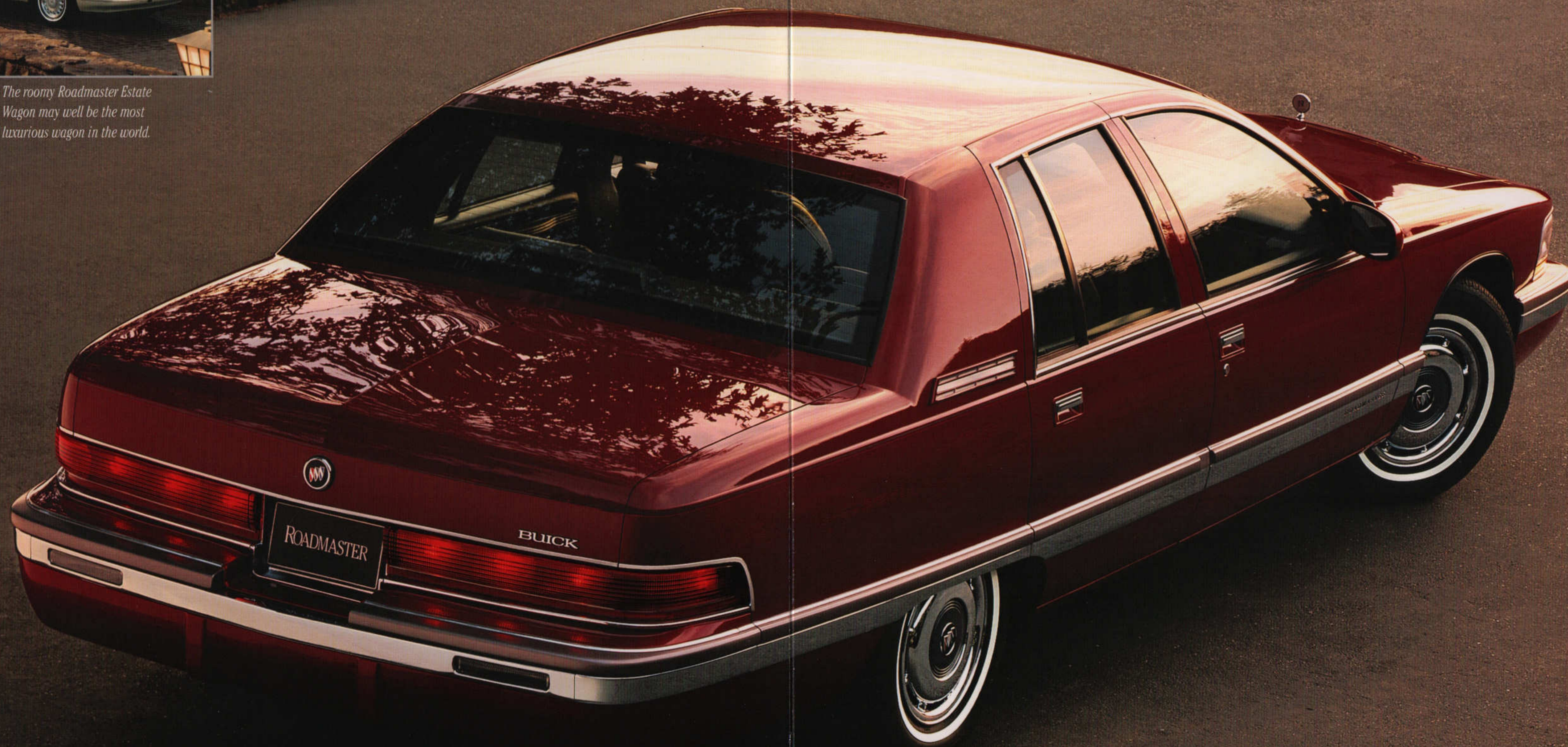
Cover Caption: Roadmaster Sedan's DynaRide® suspension and Seat Comfort Team-designed orthopedically sensitive seats will smooth out long and short trips.