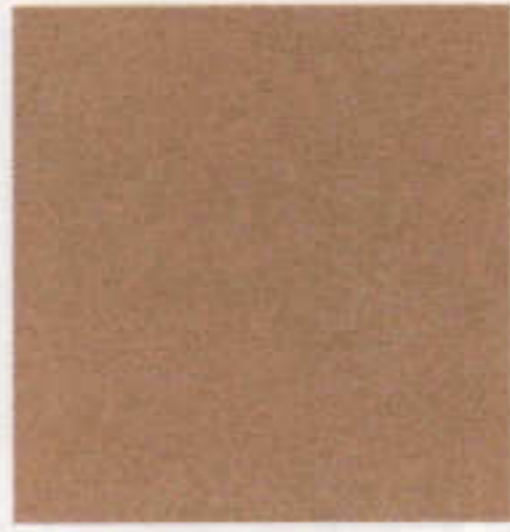
Light Driftwood Metallic (33)