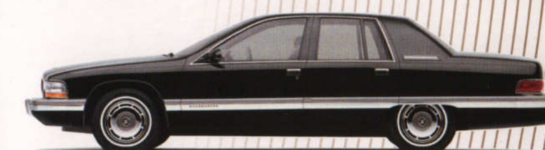
Roadmaster Limited Sedan