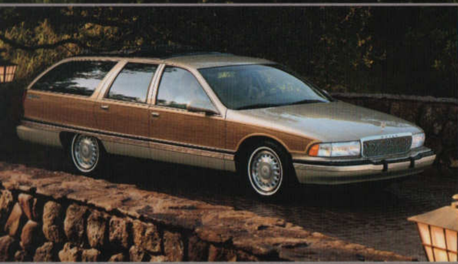
The roomy Roadmaster Estate Wagon may well be the most luxurious wagon in the world.