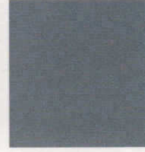
Light Adriatic Blue Metallic (36)