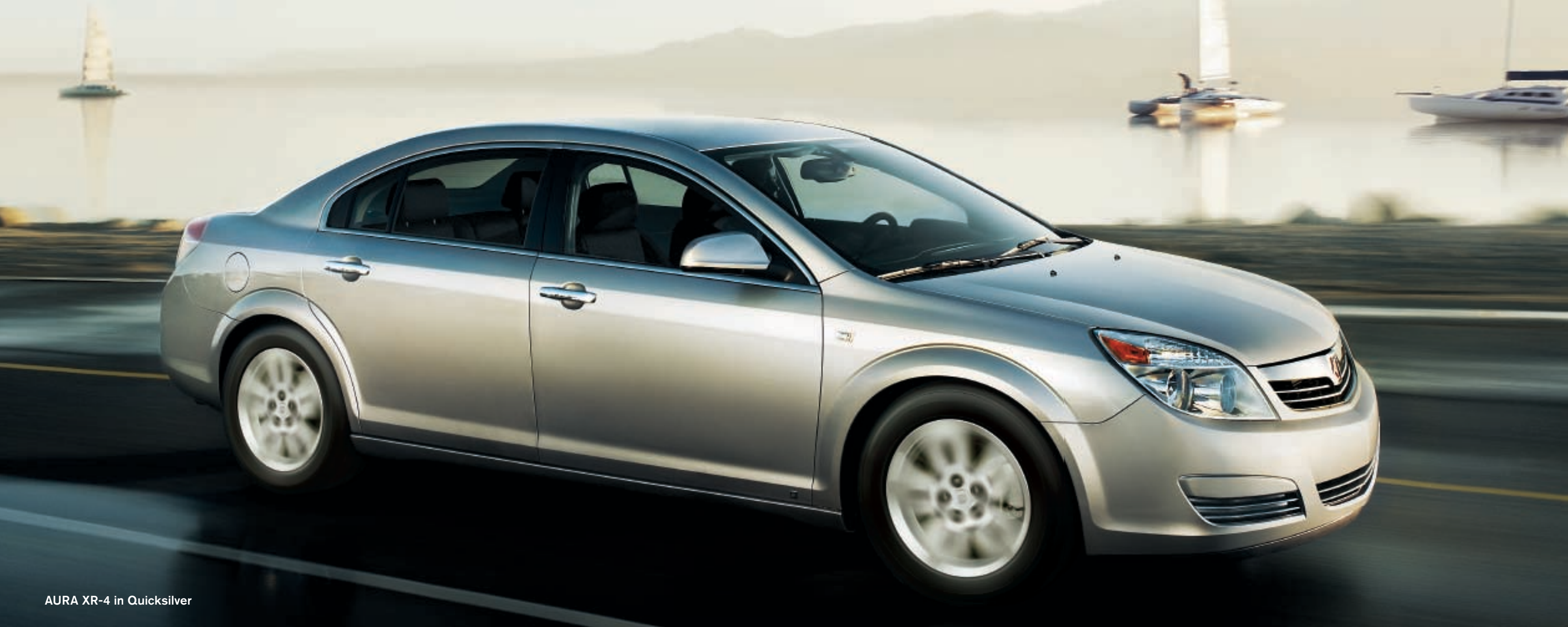
AURA XR-4 in Quicksilver

EPA-estimated 22 mpg city, 33 mpg highway