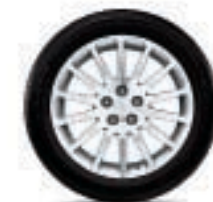
18" STANDARD ULTRABRIGHT ALLOY (XR-V6)