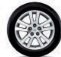
17" STANDARD MACHINED ALLOY (XR-4, Hybrid)