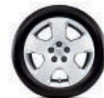
17" STANDARD TRIM (XE)