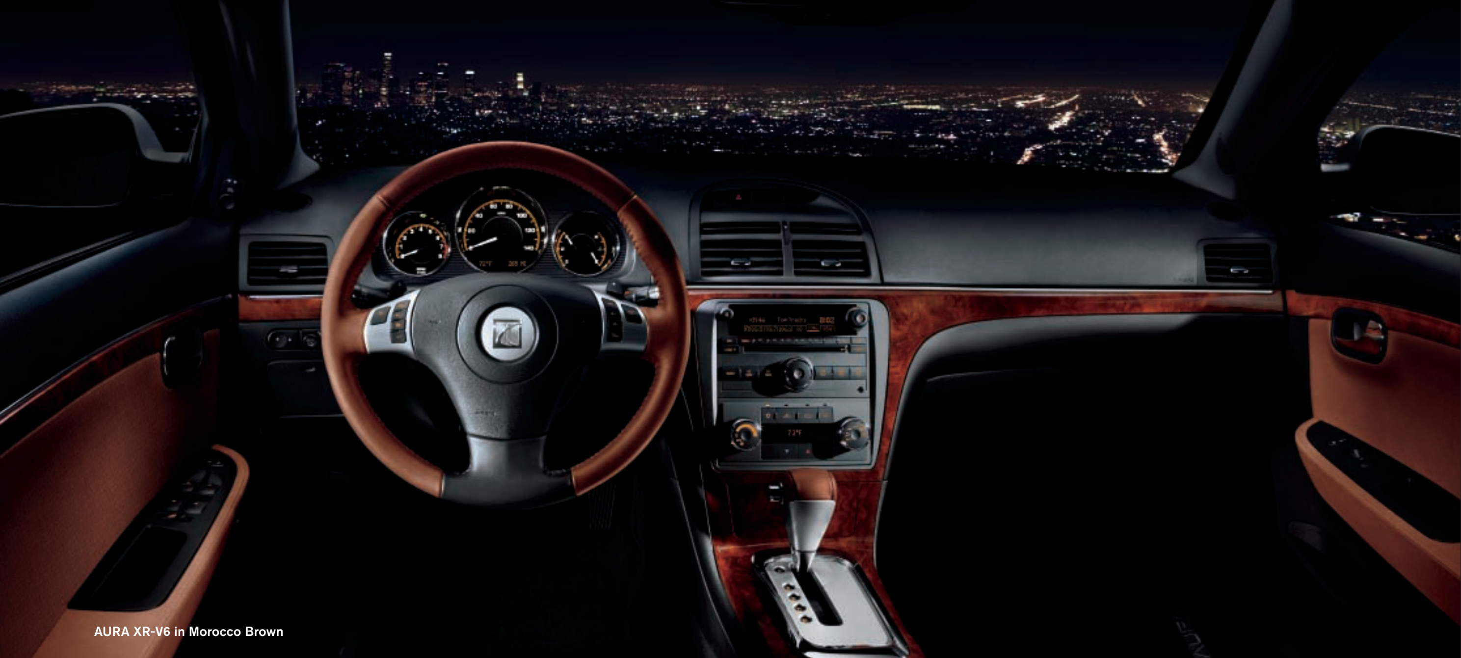
AURA XR-V6 in Morocco Brown

Rethink interior. The well-connected traveler.