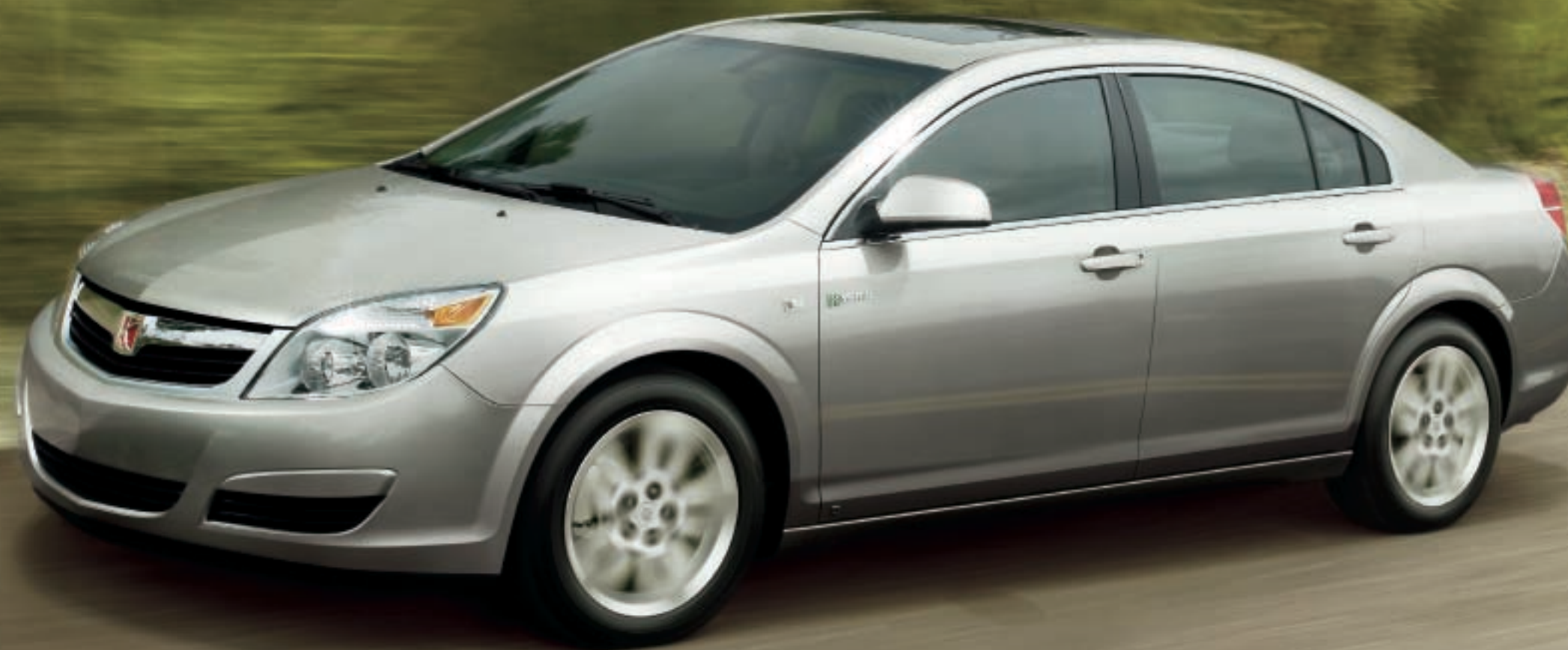
AURA Hybrid in Quicksilver

EPA-estimated 26 mpg city, 34 mpg highway