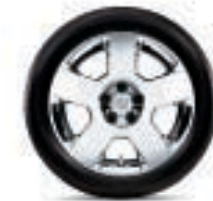
17" AVAILABLE CHROME TRIM (XE)