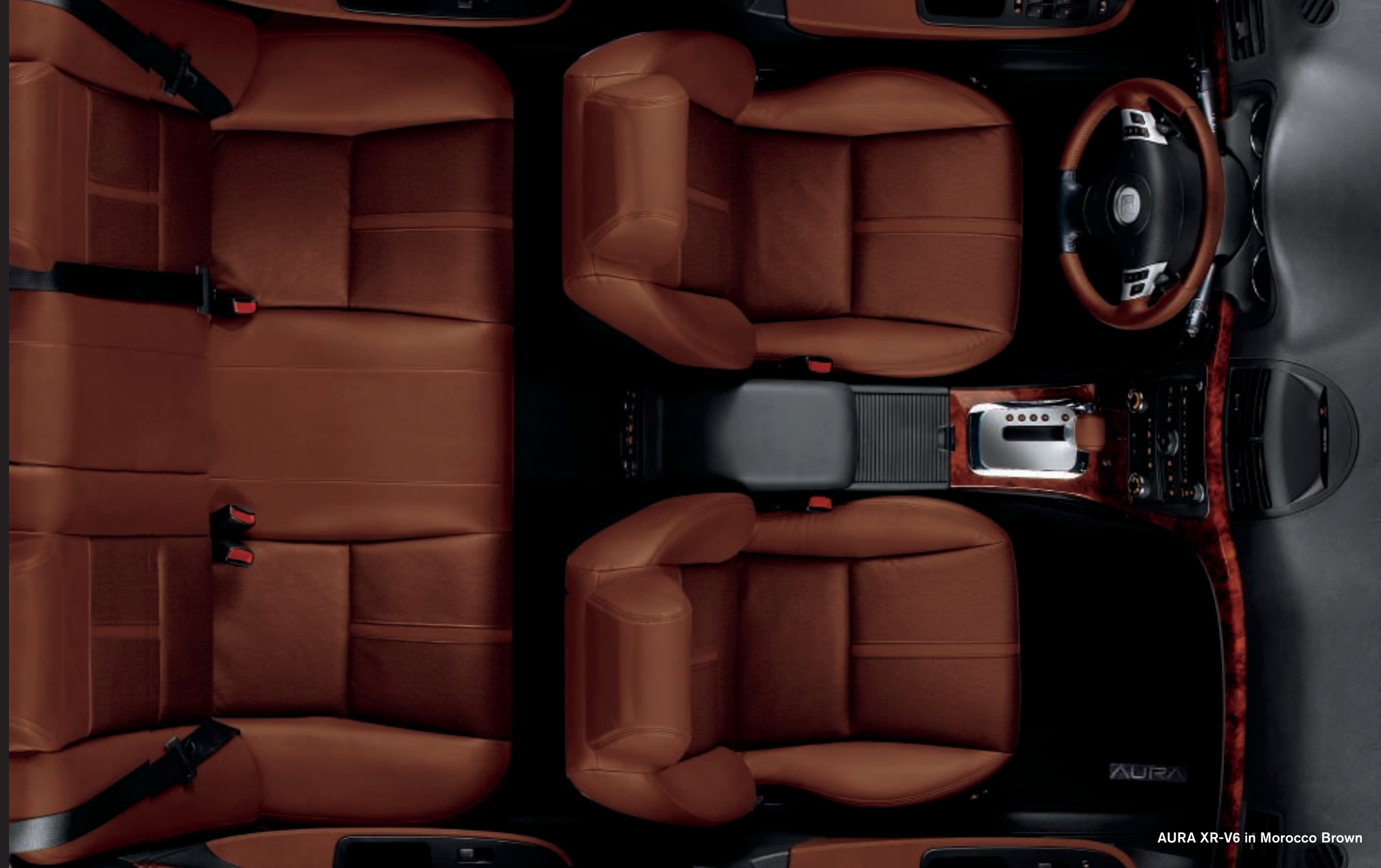
AURA XR-V6 in Morocco Brown

Rethink retreat. We'll keep everything quiet. You just relax. The cabin in the AURA is exceptionally quiet, comfortable, and tastefully done. It surrounds you with premium tactile surface materials, and we even wrapped the AURA's interior pillars in fabric for an added level of refinement. Intricate stitching details accent the generous leather-appointed seats, which are standard on the XR.