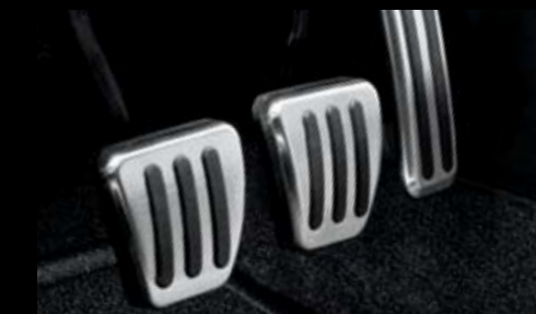
Sport Pedal Package