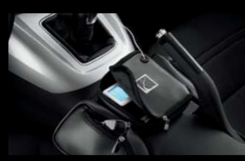
Console Saddle Bag