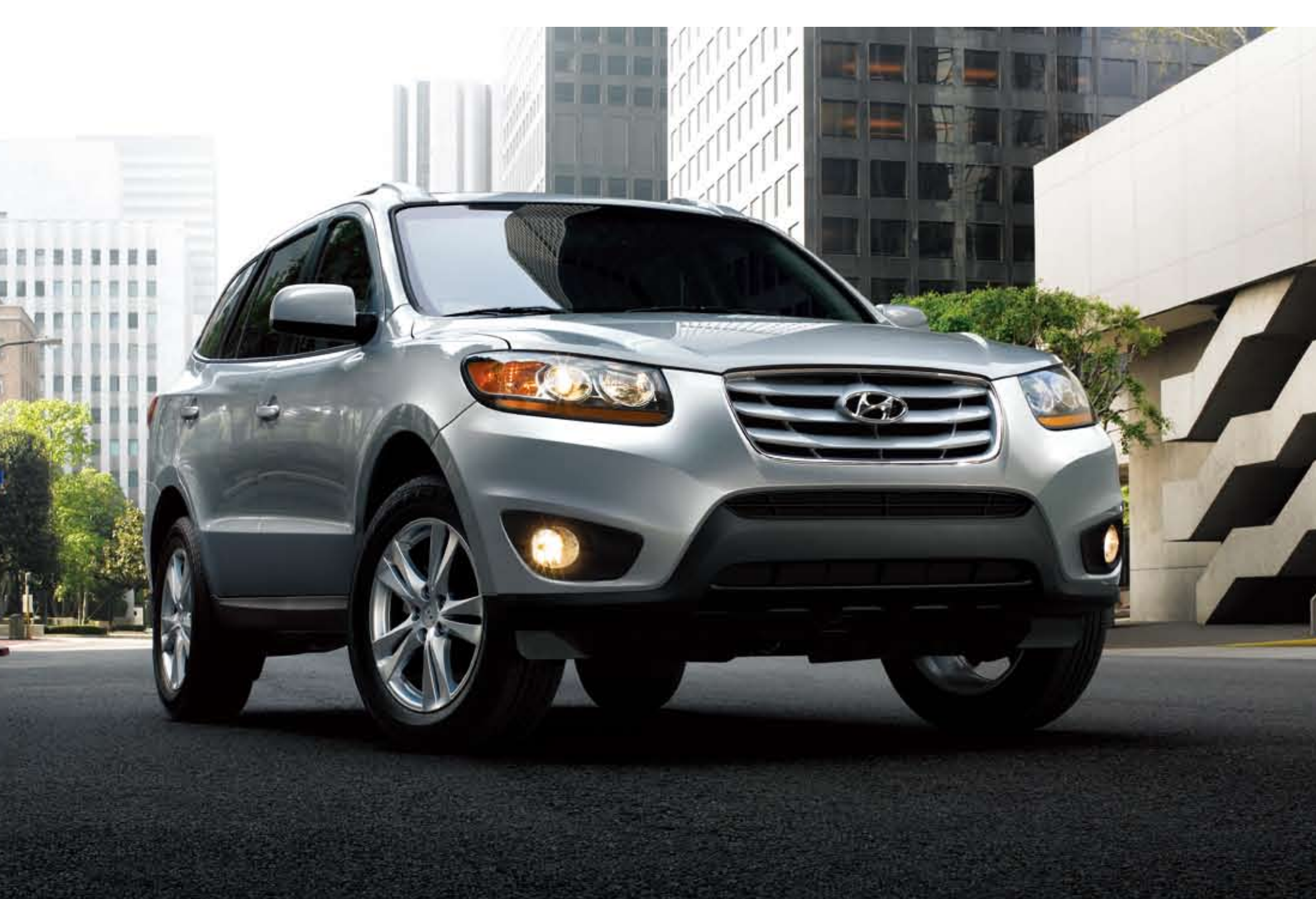
2010 HYUNDAI_SANTA FE