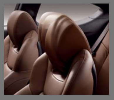
ACTIVE FRONT HEAD RESTRAINTS

The confidence you feel behind the wheel when accelerating or driving on slippery road surfaces stems from an advanced Traction Control System.<sup>4</sup> If wheelspin is detected, Genesis Coupe instantly responds by reducing engine power and/or applying braking to the wheel that is slipping, effectively rerouting power to the wheel with greater traction.