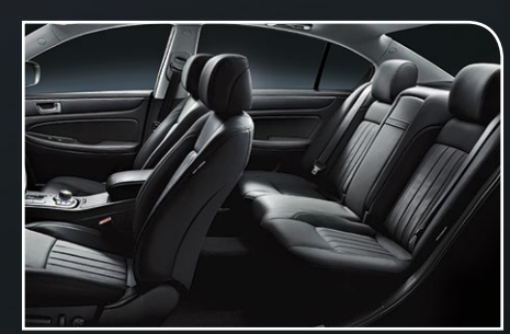
JET BLACK LEATHER / BLACK MAPLE WOOD