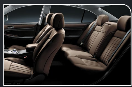
SADDLE LEATHER / ZEBRA WOOD