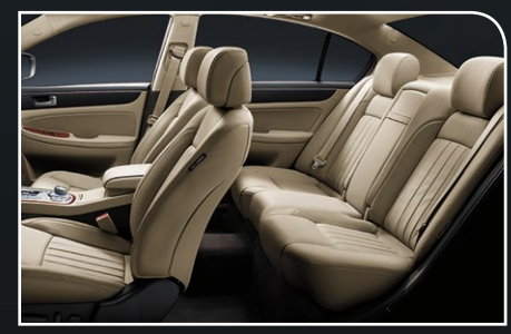
CASHMERE LEATHER / RED EUCALYPTUS WOOD