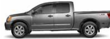
PRO-4X KING CAB AND CREW CAB