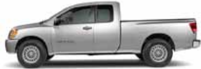
XE KING CAB AND CREW CAB