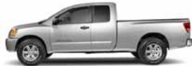
SE KING CAB AND CREW CAB