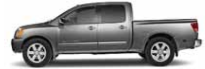
LE CREW CAB