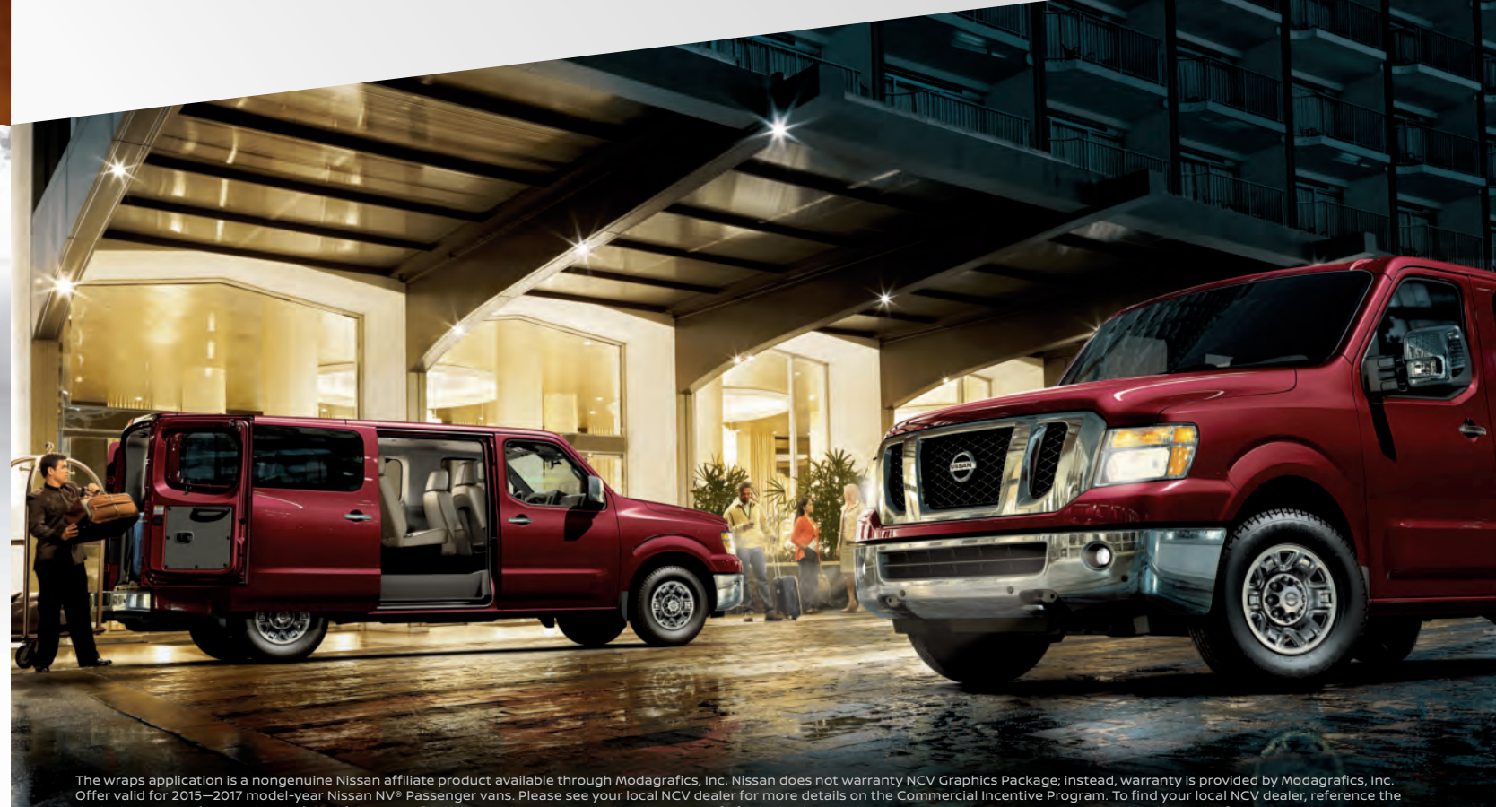
dealer locator at NissanCommercialVehicles.com. <sup>3</sup>Vehicle Graphics Packages do not cover roof of vehicle. <sup>4</sup>Roadside Assistance and Trip Interruption available during the first 36 months or 36,000 miles (whichever occurs first) after initial new vehicle delivery, Restrictions apply, See Owner's Manual for details,

<sup>1</sup>Claim based on years/mileage (whichever occurs first) covered under the New Vehicle Limited Warranty basic coverage. 2017 Nissan NV Cargo, NV Passenger v. 2016 Large Van Class; 2016/2017 Nissan NV200® v. 2016 Small Van Class. Commercial Vans compared only. Nissan's New Vehicle Limited Warranty basic coverage excludes tires, corrosion coverage and federal and California emission performance and defect coverage. Other terms and conditions apply. See dealer for complete warranty details. NV200® Taxi is covered under a separate limited warranty with a different level of coverage. <sup>2</sup>The Commercia Incentive Packages are products designed, manufactured, tested and installed by an independent supplier, Modagrafics, specifically for NV® Passenger vans. Modagrafics products are not covered by the Nissan New Vehicle Limited Warranty. Nissan is not responsible for the safety or quality of the installation or alterations made by Modagrafics to your NV® Passenger van. See your local dealer for details