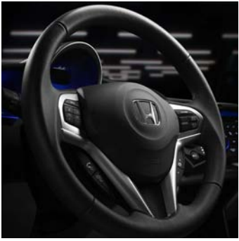
The thick, leather-wrapped 3-spoke steering wheel (EX) adds to the performance attitude of the interior. The combination of the tilt and telescopic steering column with the seat-height adjustment means you will undoubtedly find the perfect driving position.