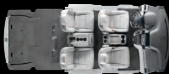
4-passenger cargo mode*

Party of 4? Stow the 3rd row for more cargo space.