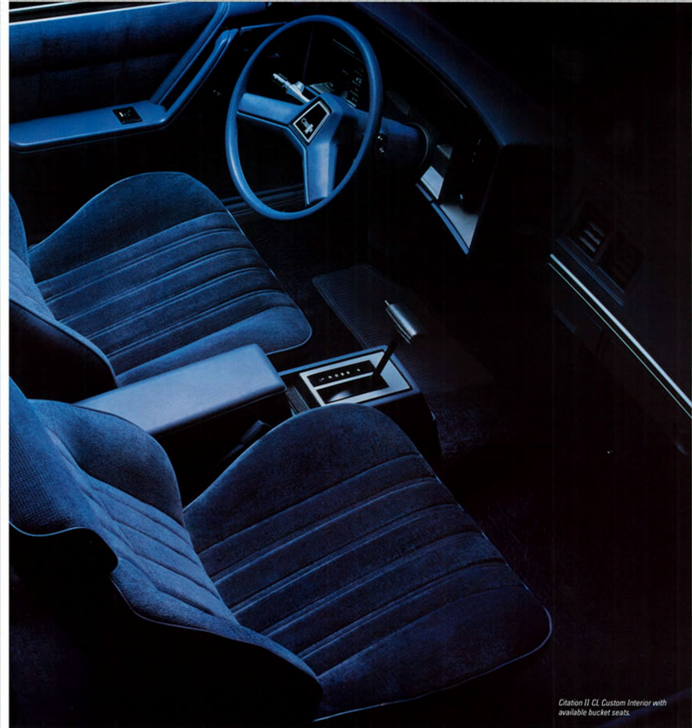
Citation II CL Custom Interior with available bucket seats.