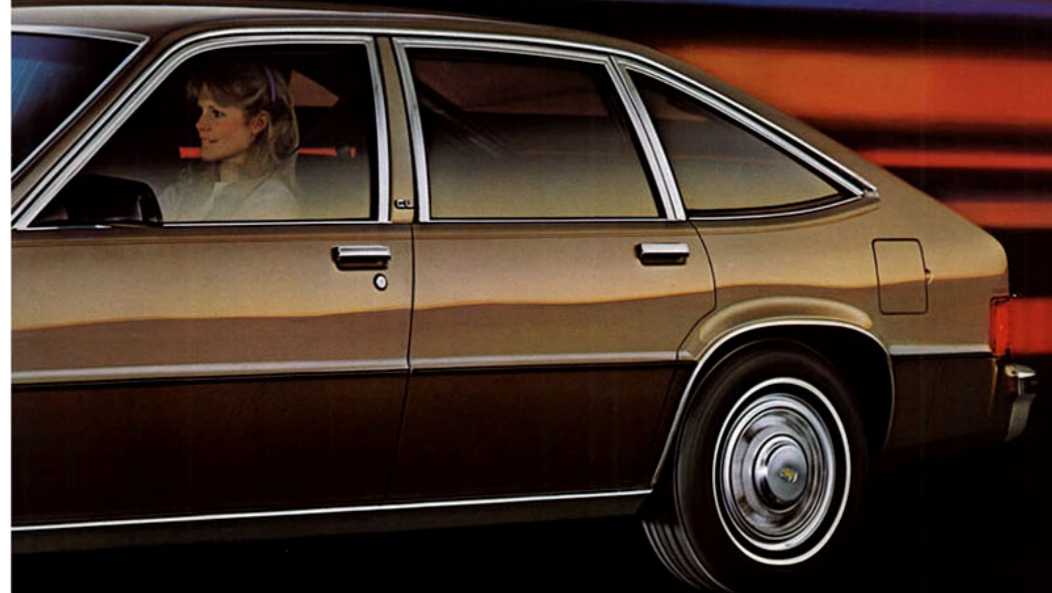
Citation II 4-Door Hatchback with CL Custom Interior.

Important: A word about this catalog. We have tried to make this catalog as comprehensive and factual as possible. However, since the time of printing, some of the information may have been updated. Also, some of the equipment shown or described throughout this catalog is available at extra cost. Your dealer has details and, before ordering, you should ask him to bring you up to date. The right is reserved to make changes at any time, without notice, in prices, colors, materials, equipment, specifications and models. Check with your Chevrolet dealer for complete information.