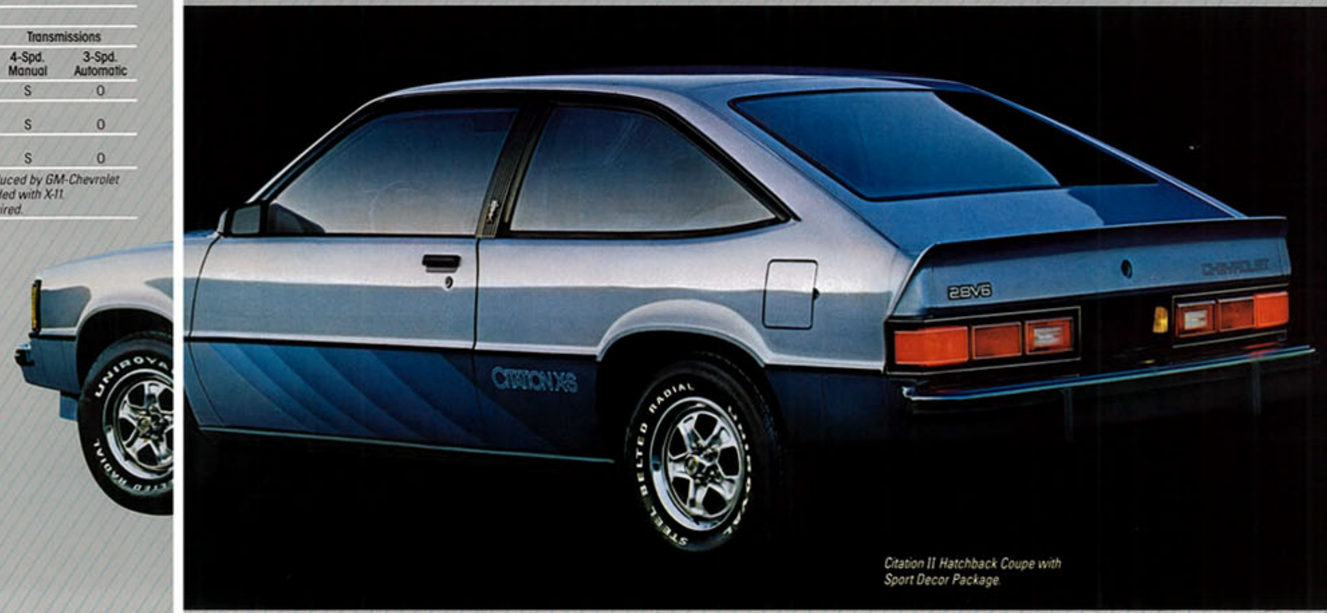
Citation II Hatchback Coupe with Sport Decor Package.

An option that offers service protection in addition to that provided by GM's new-vehicle limited warranty. Available only in the U.S. and Canada for the 1984 model year. Ask your dealer about this option.