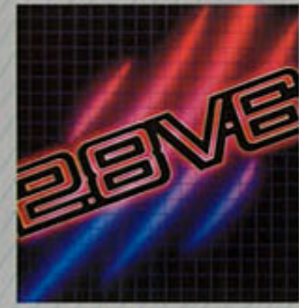
2.8 Liter V6 and High Output 2.8 Liter V6 engines are available on all Citation II models.

An optional console adds a sporty flavor to your Citation II (available only with optional bucket seats).