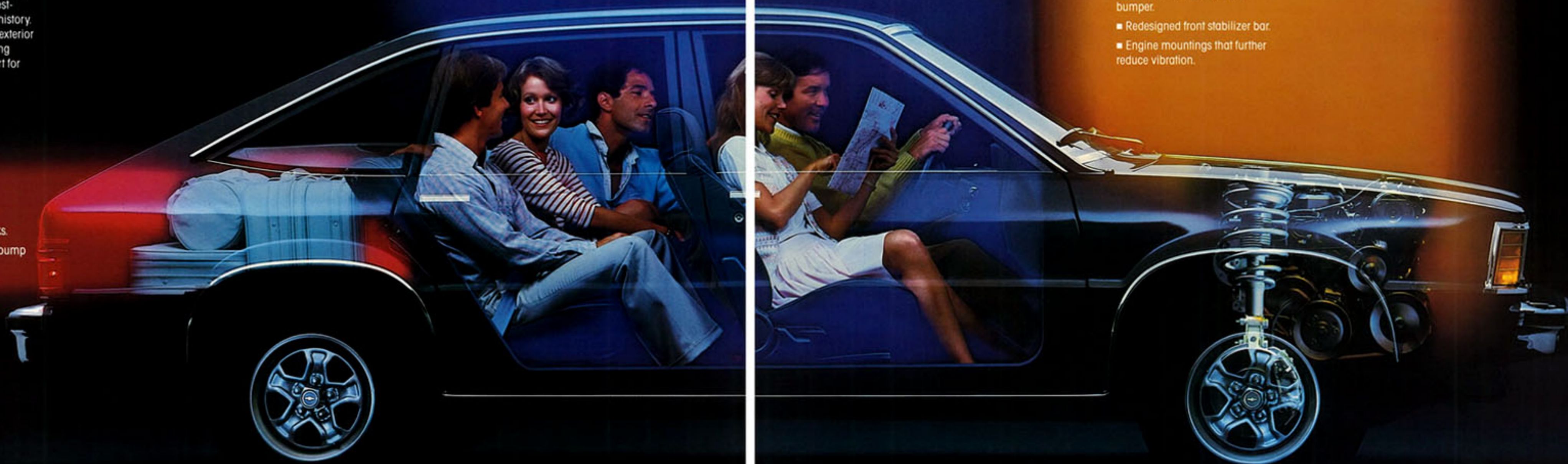
Citation II Hatchback Sedan.