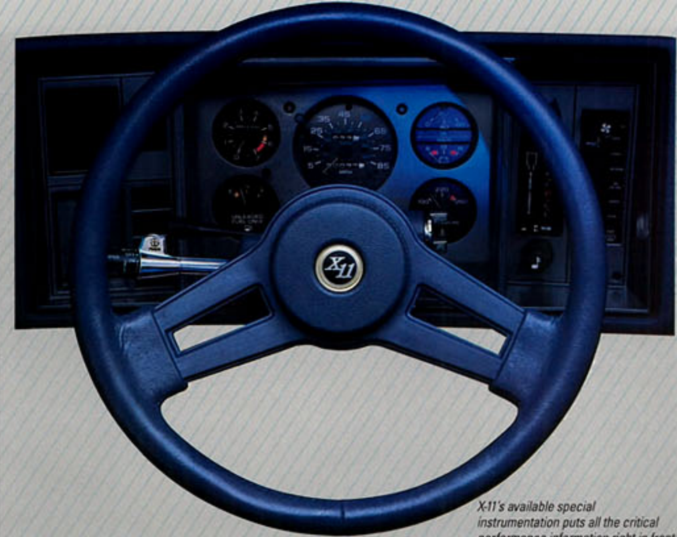
X-11's available special instrumentation puts all the critical performance information right in front of you. Available sport steering wheel also shown.