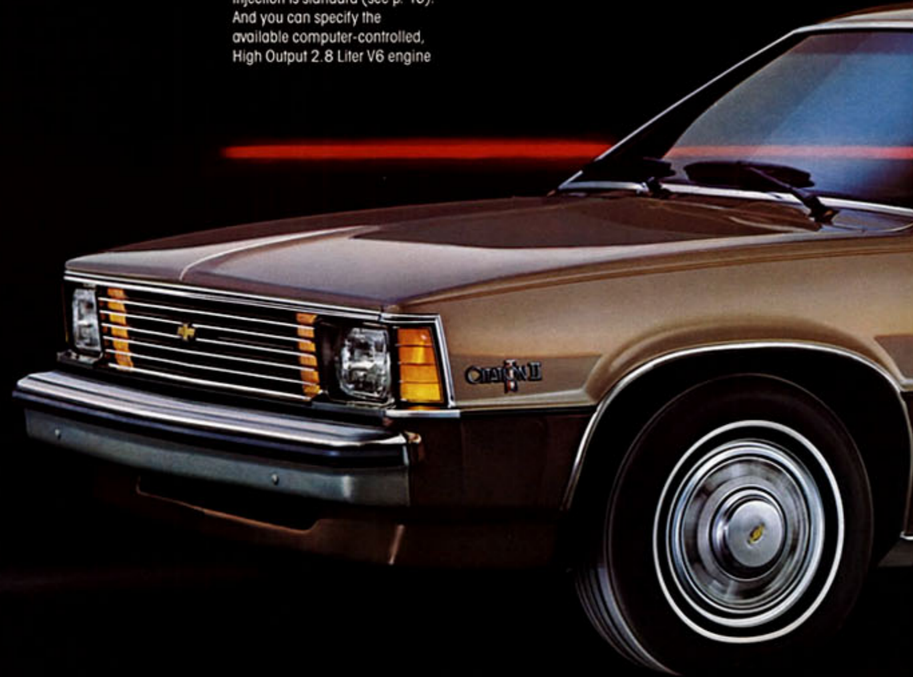
Cover: Citation II Hatchback Sedan.

and the road-holding F41 Sport Suspension option to make your Citation II cut and run like a sporty X-11. Well over one million owners have enjoyed this kind of versatile performance. You'll find Citation II an even better value for 1984. For all the engineering refinements made to our "Versatile Performer" since its introduction, turn the page and take a close look at Citation II.