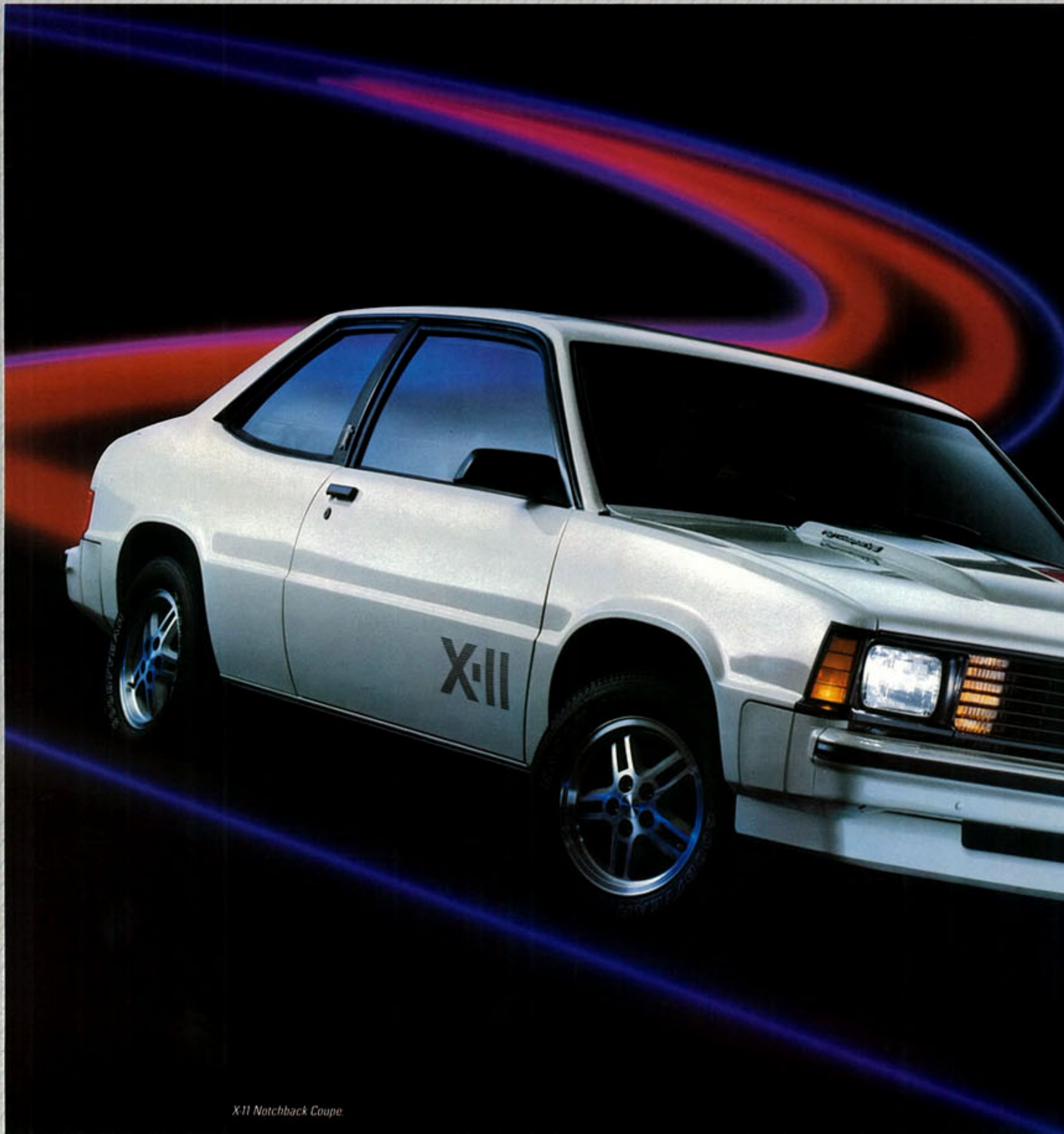
X-11 Notchback Coupe.