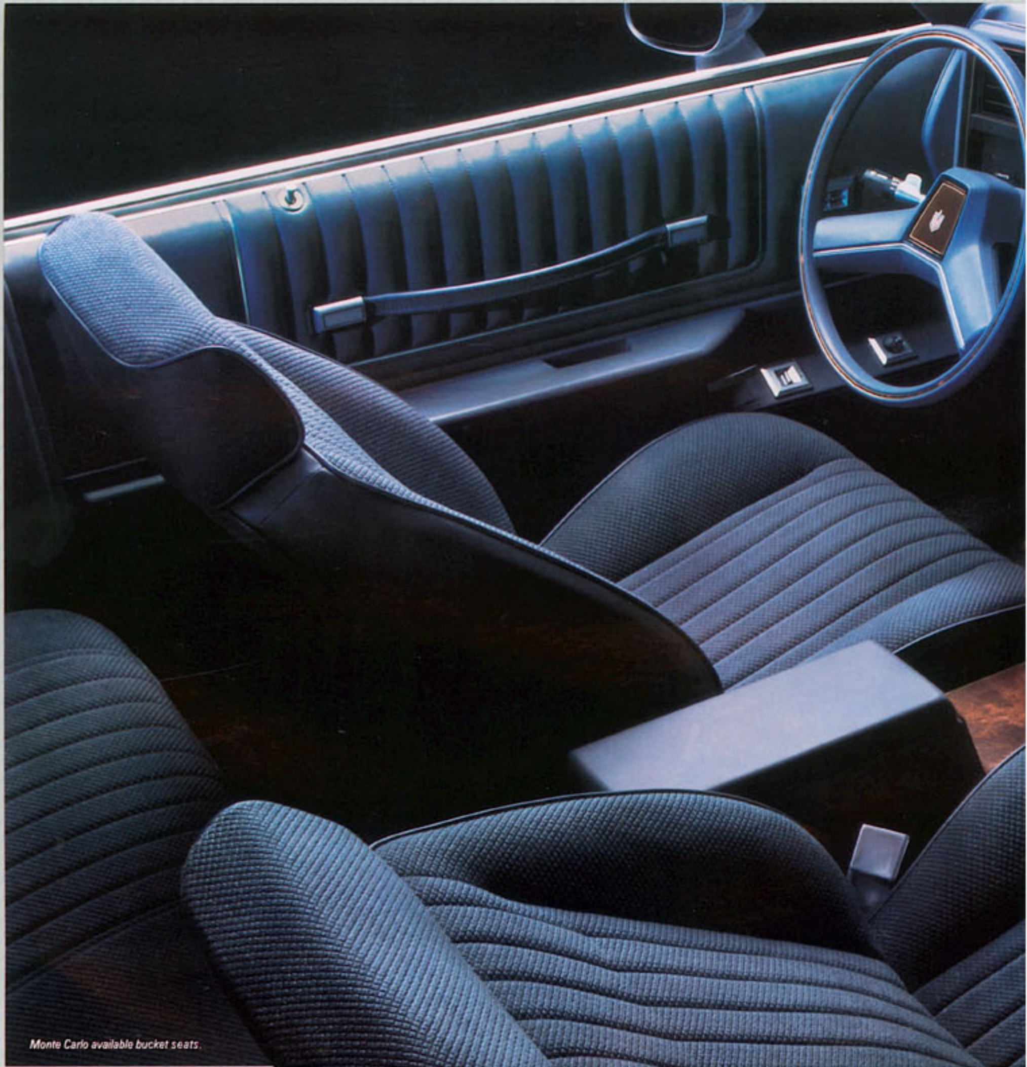
Monte Carlo available bucket seats.