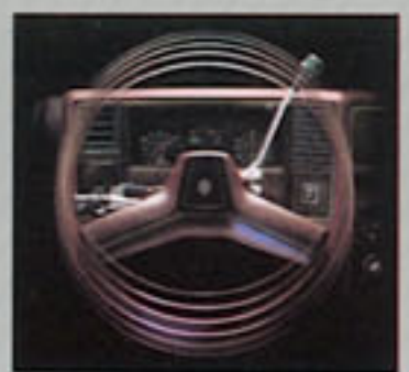
Optional Comfortilt steering wheel adjusts to your most comfortable driving position.