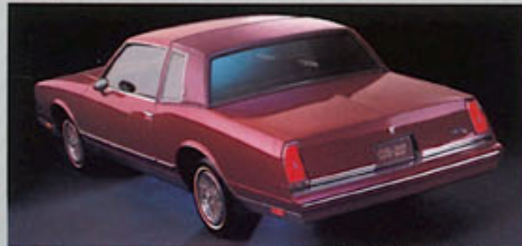
Monte Carlo's optional Landau vinyl roof adds a note of style while the available electric rear window defogger is a welcome convenience in bad weather.