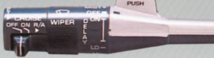
Optional electronic speed control with resume feature has a new fingertip speed adjustment.