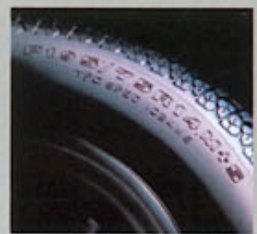
New standard (except SS model) all-season, M+S-rated (mud and snow), steel-belted radial tires are designed for low noise and long wear with excellent performance in all driving conditions.

Dark Brown* Light Maroon* Dark Maroon* Bright Silver* White Dark Blue* Light Blue* Dark Fern* Light Fern* Dark Brown* Light Brown* Dark Maroon* Light Maroon*