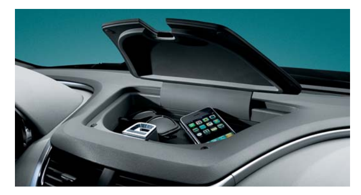
An auxiliary glove box, located in the upper instrument panel, is the perfect place to store small items such as a cell phone, CDs and sunglasses.