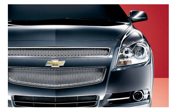
Malibu's dual-port grille is stylishly accented with chrome surrounds and a body-color bar.

1 Based on latest available competitive EPA estimates and GM Mid-Car Sedan segment. Excludes other GM vehicles.