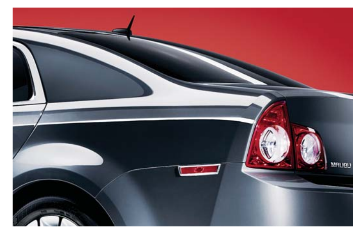
A distinctive sail panel design is incorporated into the rear profile to further accentuate the roof line.