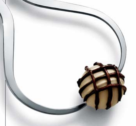
Perfection is, in fact, irresistible. In crafting Malibu's interior, our thinking was to be as exacting in the most minute details as we are in the big ones. In other words, we wanted to create an interior that is both meticulous in detail and completely satisfying in ride and comfort.