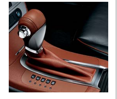
The intelligently designed six-speed automatic transmission – coupled with the ECOTEC 2.4L four-cylinder engine with Variable Valve Timing (VVT) – achieves best-in-class gas engine highway fuel economy:1 33 MPG. The transmission also helps maximize the powertrain's performance through the wide spread in the gear ratios – a steep first gear that helps deliver exceptional launch feel and a tall overdrive sixth gear that lowers rpm at high speed while reducing noise, vibration and harshness. It's standard on 2LT and LTZ.