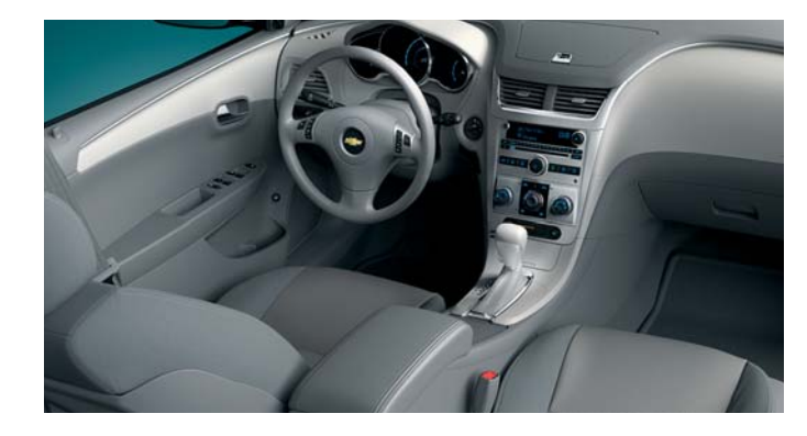
The 1LT interior features Custom Cloth front bucket seats. To further enhance your comfort, the available Power Convenience Package includes a driver six-way power seat adjuster and remote vehicle starter system.

1 XM is available only in the 48 contiguous United States. Required $12.95 monthly subscription sold separately after three trial months. All fees and programming subject to change. For more information, visit gm.xmradio.com.