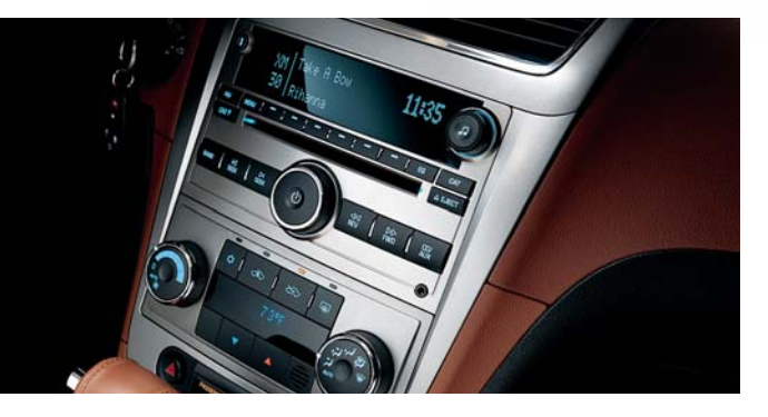
The center stack in LTZ is surrounded in metallic accents and houses controls for the automatic climate control, premium sound system and XM Radio<sup>2</sup> with three trial months.