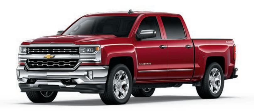
SIREN RED TINTCOAT<sup>1,2</sup>