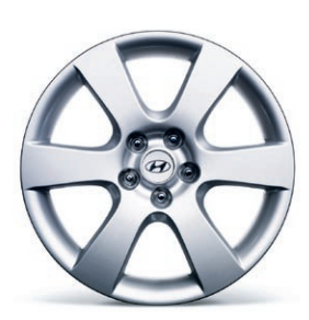
18-INCH SE/LIMITED ALLOY WHEEL