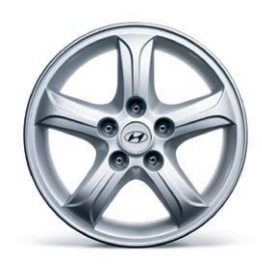
16-INCH GLS ALLOY WHEEL