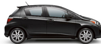
BLACK SAND PEARL