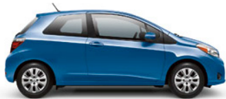
BLAZING BLUE PEARL