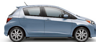
WAVE LINE PEARL