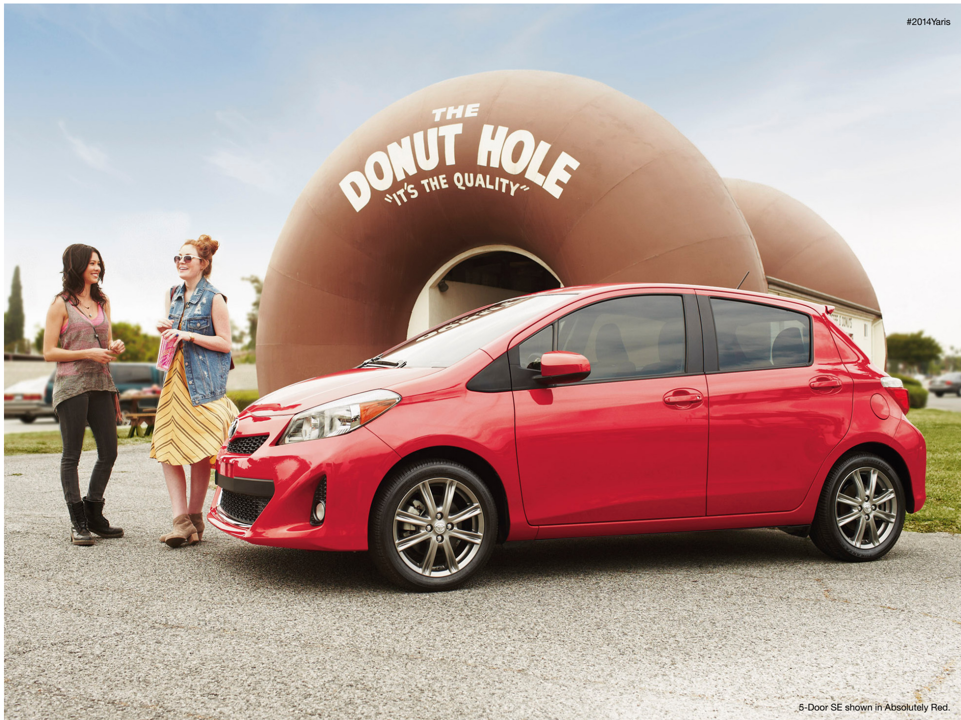
5-Door SE shown in Absolutely Red.