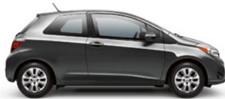
MAGNETIC GRAY METALLIC