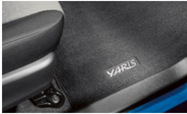
Carpet floor mats 18