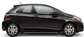
BLACK SAND PEARL