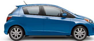
BLAZING BLUE PEARL