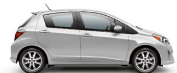
CLASSIC SILVER METALLIC