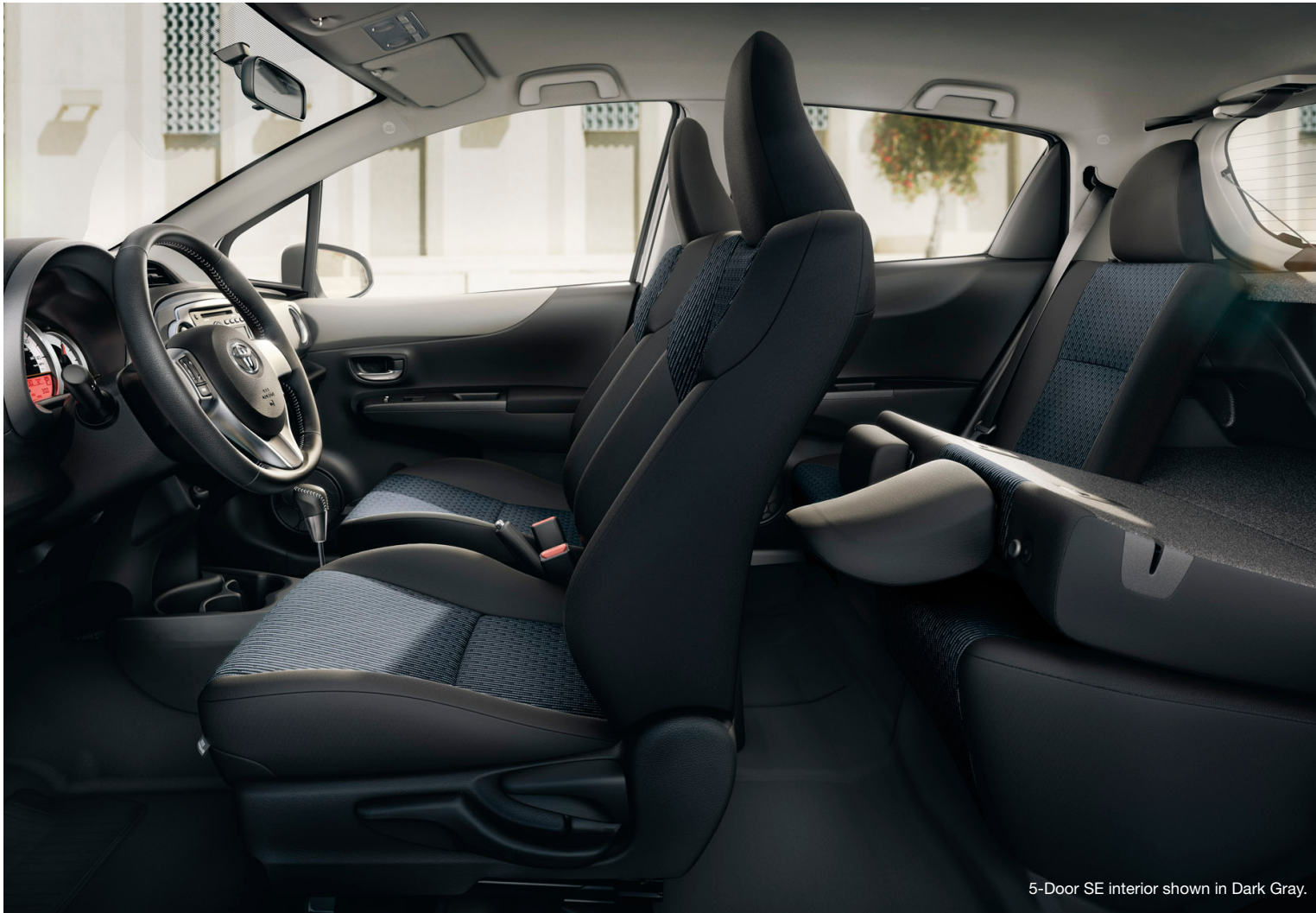
5-Door SE interior shown in Dark Gray.