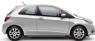
CLASSIC SILVER METALLIC