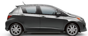
MAGNETIC GRAY METALLIC