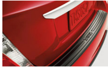
Rear bumper protector

A wide range of Genuine Toyota Accessories is available to help you make your Yaris your own. Considering how appealing Yaris is to begin with, these quality products will be like icing on the cake. Some accessories may not be available in all regions of the country. See your Toyota dealer for details.