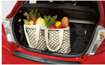
Cargo net — envelope 1