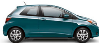
LAGOON BLUE MICA