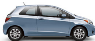
WAVE LINE PEARL