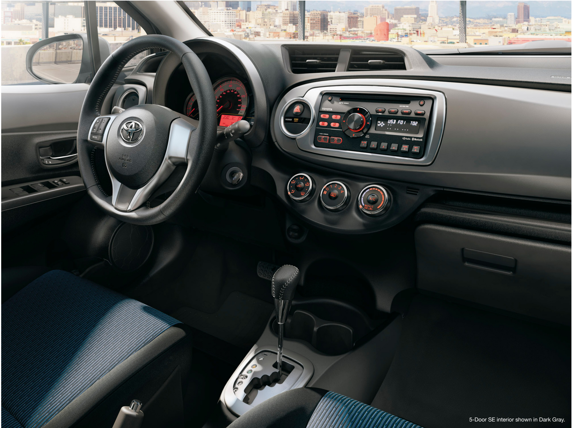
5-Door SE interior shown in Dark Gray.