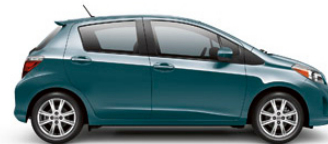
LAGOON BLUE MICA