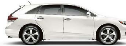
BLIZZARD PEARL 1