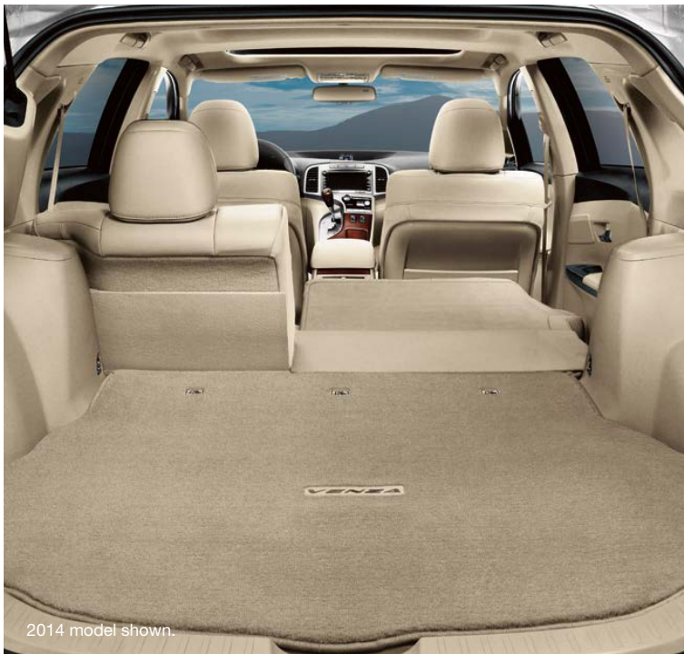
2014 model shown.