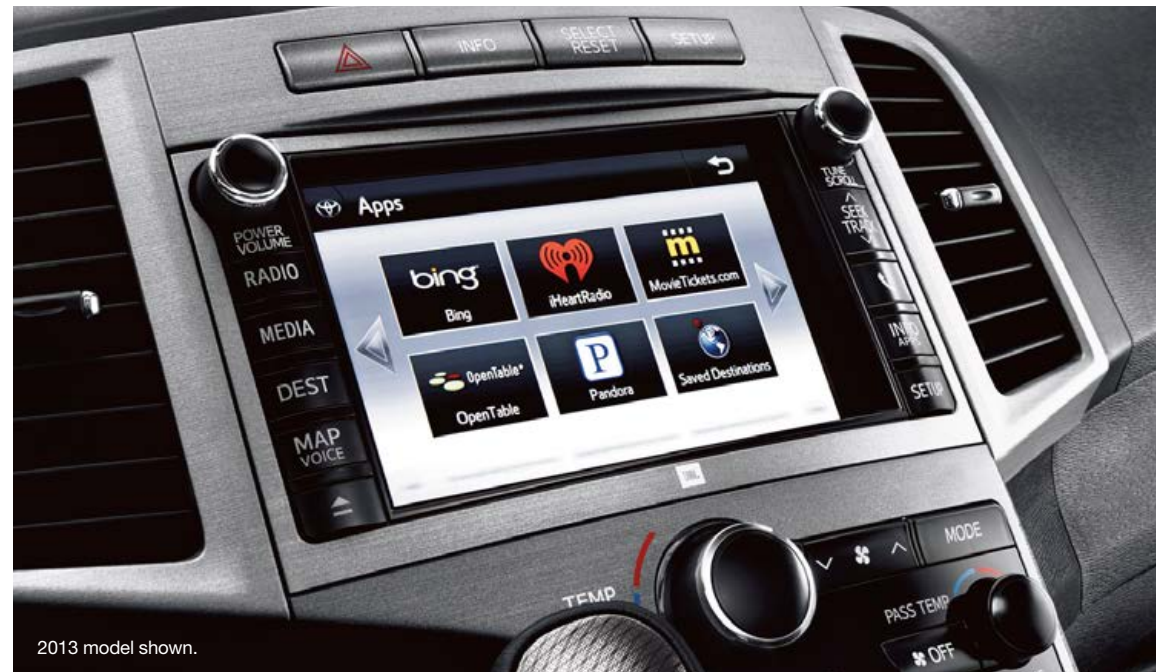
2013 model shown.