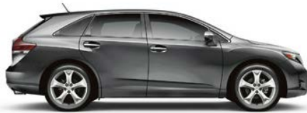
MAGNETIC GRAY METALLIC