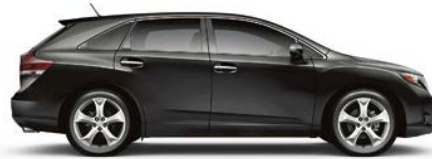
ATTITUDE BLACK METALLIC