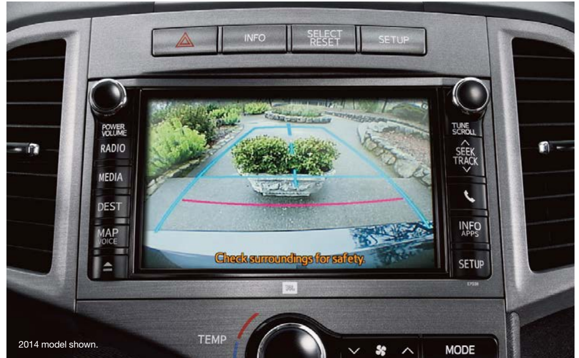
2014 model shown.

XLE's and Limited's leather-trimmed multi-stage heated front seats allow each front occupant to dial in their own level of comfort.