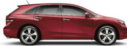
BARCELONA RED METALLIC