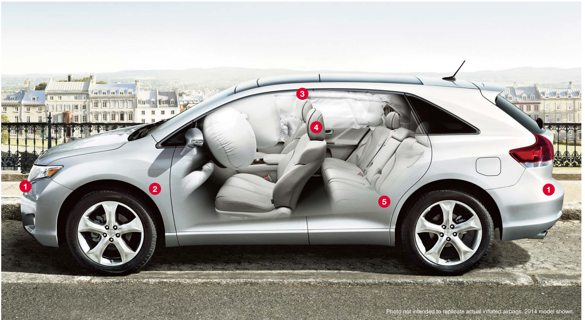
Photo not intended to replicate actual inflated airbags. 2014 model shown.

Helping to protect the smaller members of your family, LATCH (Lower Anchors and Tethers for CHildren) includes anchors and tethers on each outboard rear seat.