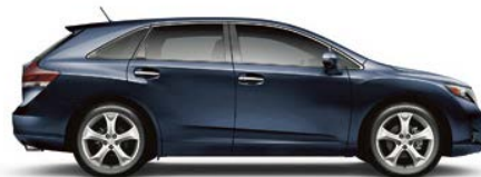
PARISIAN NIGHT PEARL