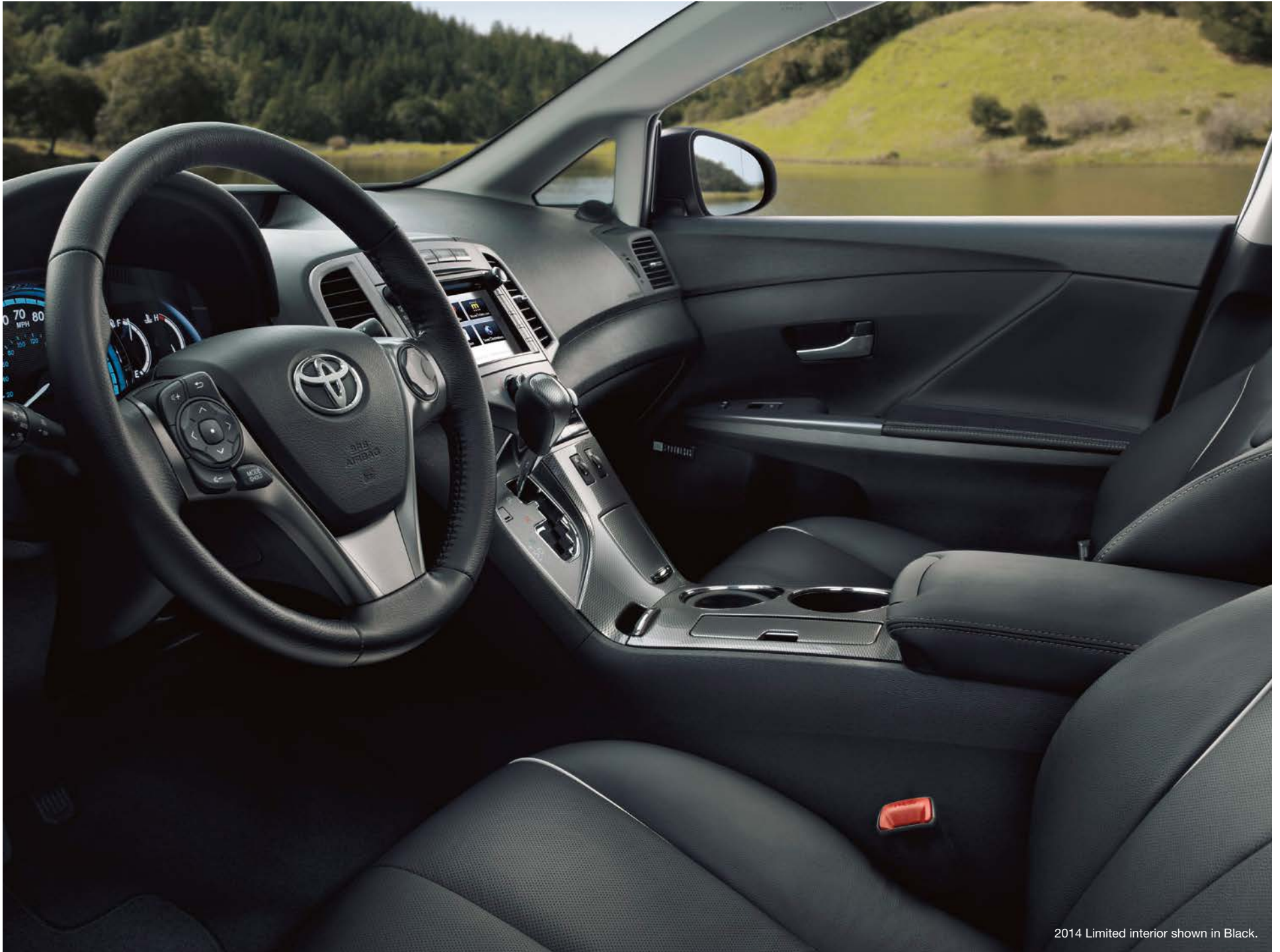
2014 Limited interior shown in Black.