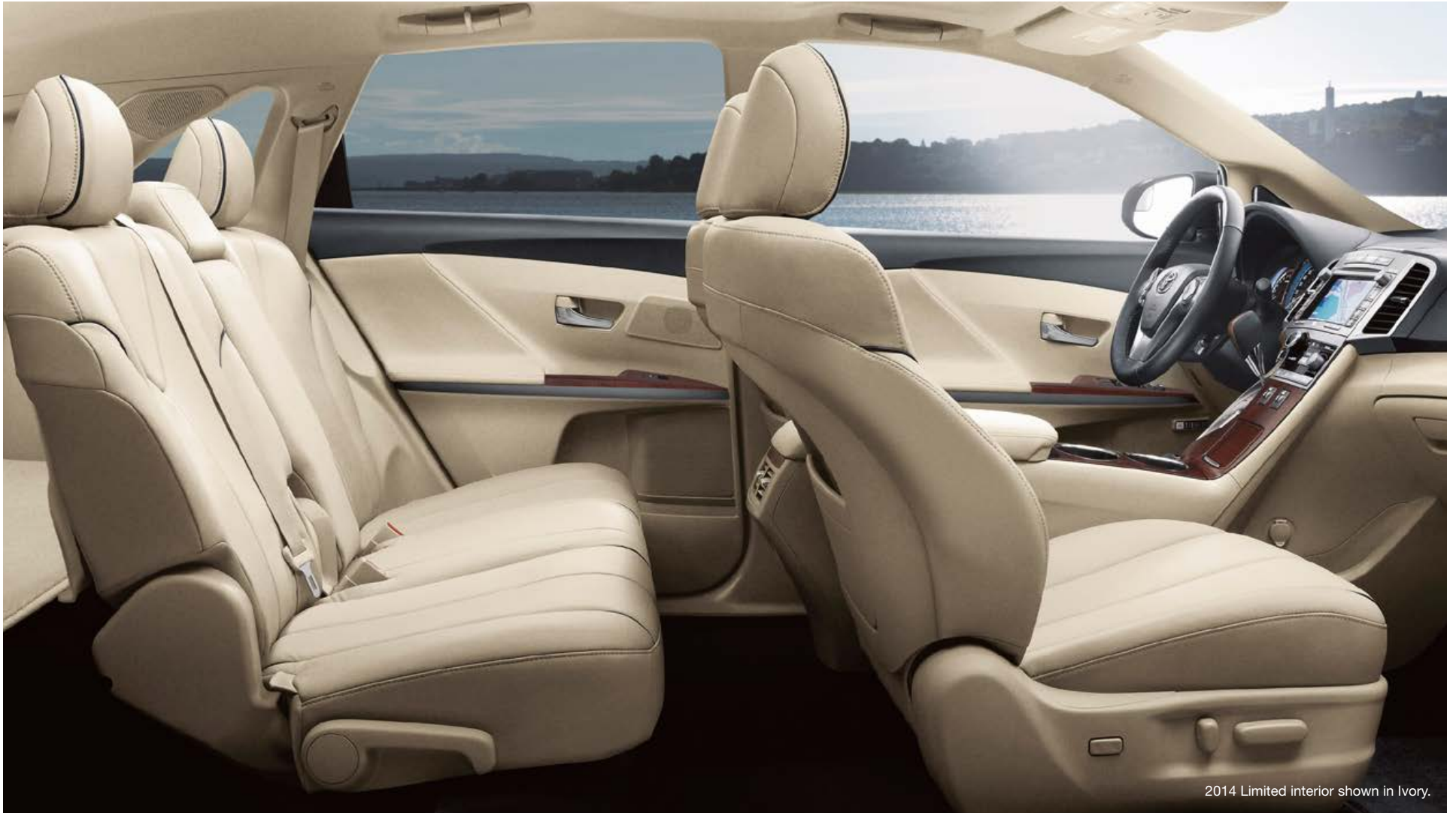
2014 Limited interior shown in Ivory.

With its thoughtful design and attention to craftsmanship, Venza is a truly remarkable blend of comfort, style and versatility.