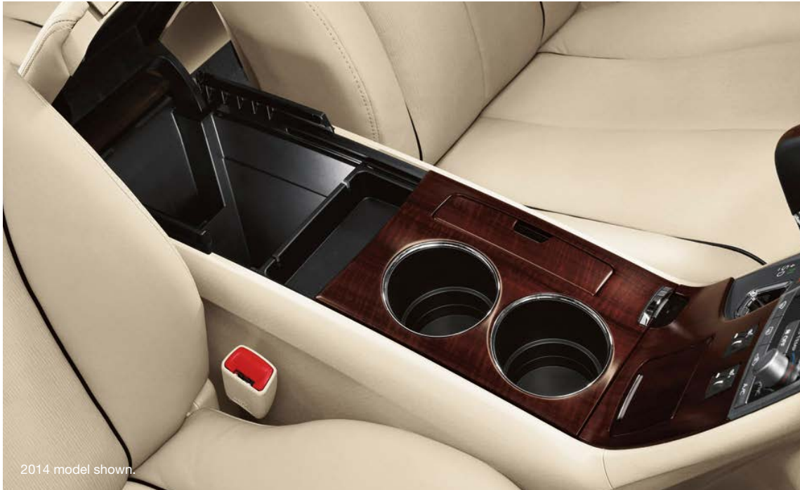
2014 model shown.