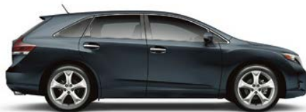
COSMIC GRAY MICA