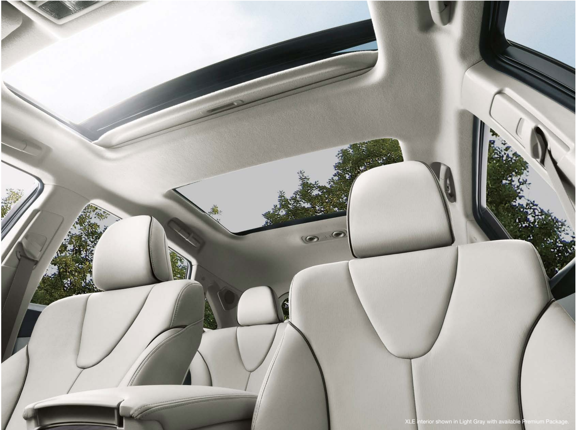
XLE interior shown in Light Gray with available Premium Package.