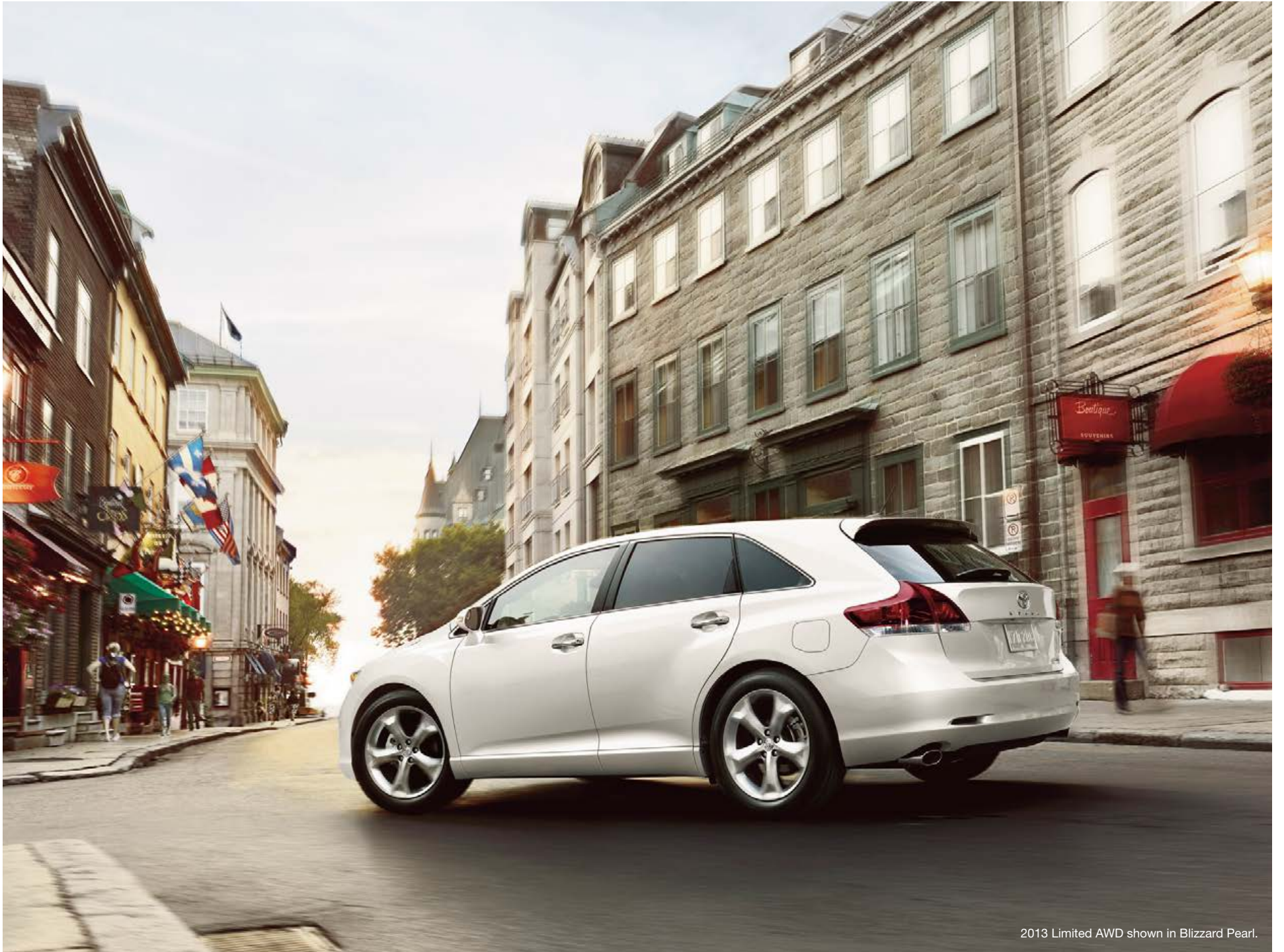
2013 Limited AWD shown in Blizzard Pearl.