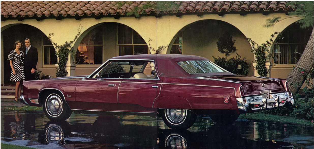
The Imperial LeBaron Four-Door Hardtop is distinguished by its formality, accepted for its elegance.