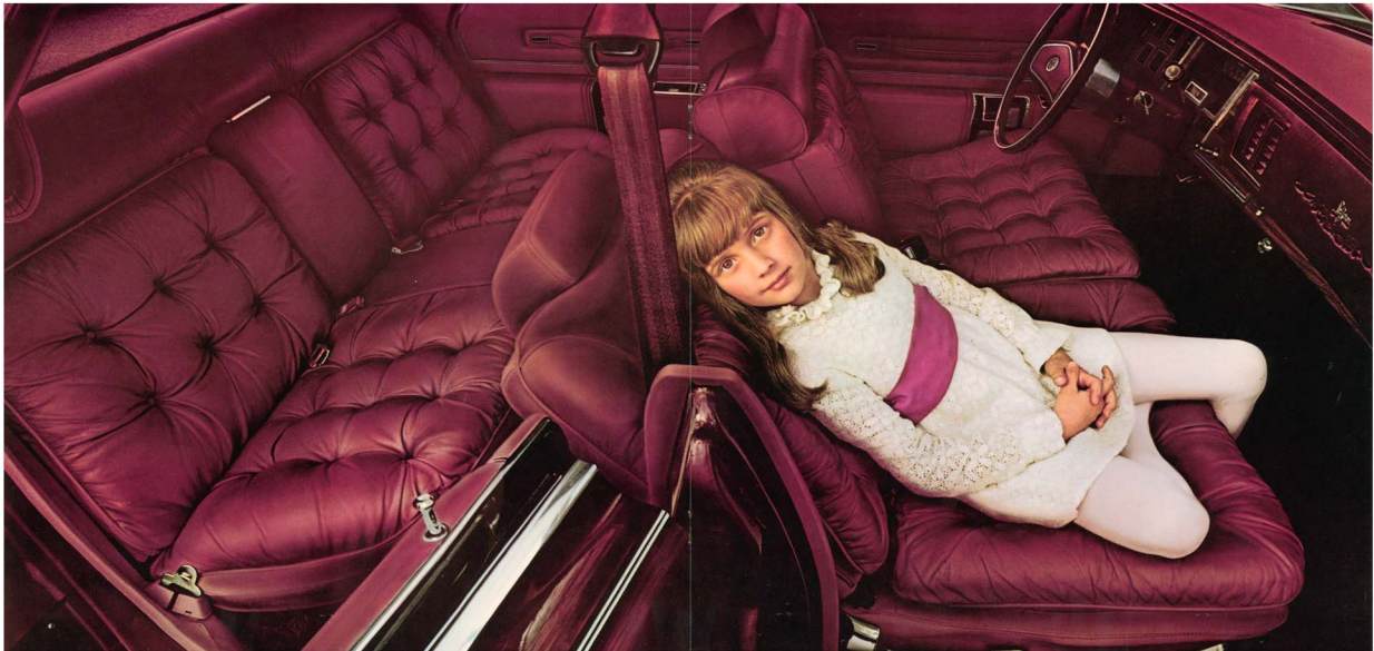
The rich leather interior, trimmed with vinyl, includes a standard reclining front seat on the Four-Door Imperial.