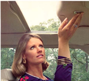
The power sun roof is a popular option for Two-Door or Four-Door models.