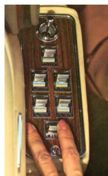
Optional door lock shown with standard power window controls.