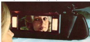
Lighted visor vanity mirror is standard.