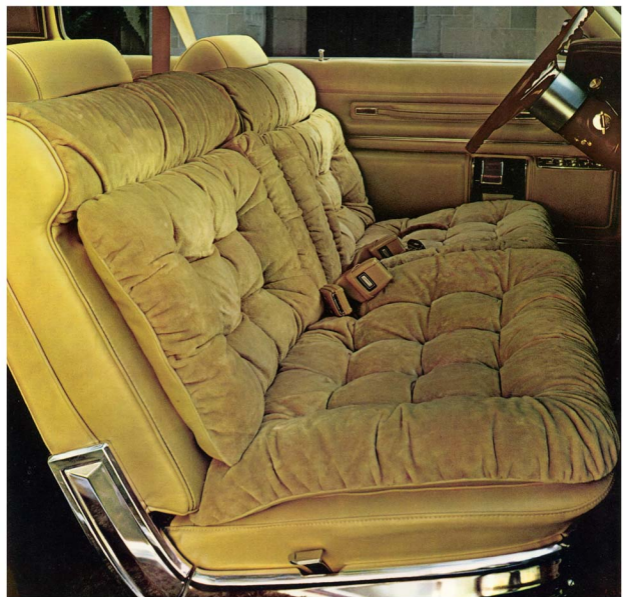
The Imperial standard interior consists of exceptionally comfortable velvet cloth cushions combined with leather and vinyl.