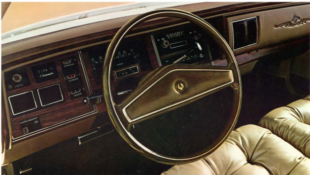
Conceived with your convenience in mind, this is the tasteful, fully-appointed Imperial instrument panel.

On the following pages are more convincing reasons for choosing a Chrysler Imperial. Attention to detail is a sure touchstone to quality in a luxury automobile. As you continue to look over the 1975 Imperial, you come to the conclusion that Imperial overlooks nothing.