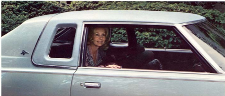
A further touch of elegance—the optional Crown Coupe opera roof.