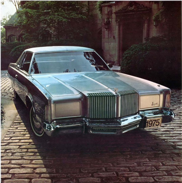
A superb example of automotive excellence, this is the Imperial LeBaron Crown Coupe.