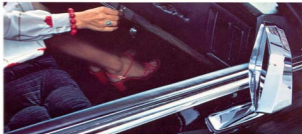
Optional right side remote-control rearview mirror.