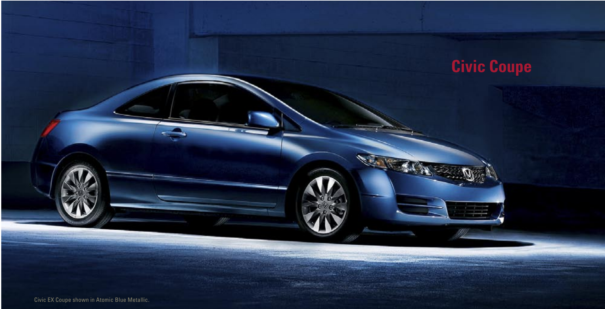
Civic EX Coupe shown in Atomic Blue Metallic.

Speed up the attraction. The catalyst? A Honda Civic Coupe. With a bolder front grille, sleeker front bumper and sharper moves, the new Civic Coupe will definitely spark a reaction. Inside, the amenities are just as attention-getting, like Honda's USB Audio Interface, 4 standard on EX models and above. The fun factor just increased exponentially. civic.honda.com