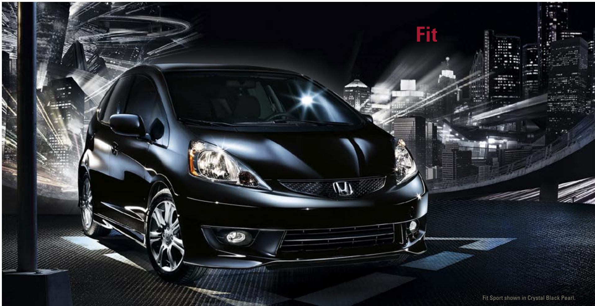
Fit Sport shown in Crystal Black Pearl.

Let's expand our expectations. Let's make choices that will benefit all of us. Like a vehicle big enough to comfortably carry five and their gear, yet gets up to 35 mpg! 1 A super-spunky engine. Trigger-happy paddle shifters on Fit Sport. ® An interior with the flexibility of a contortionist. And a host of standard safety features, including Honda's exclusive Advanced Compatibility Engineering™ body structure. Honda Fit. A city's greatest champion. fit.honda.com