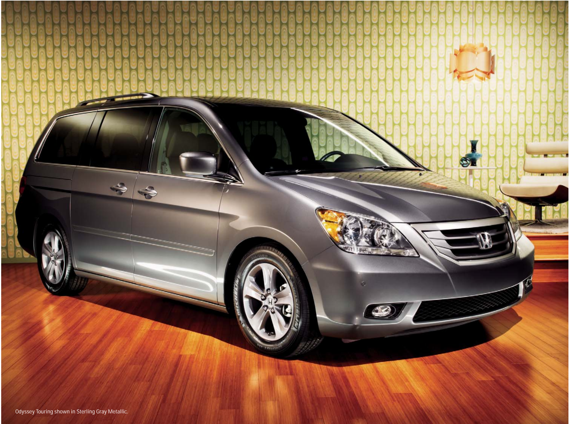
Odyssey Touring shown in Sterling Gray Metallic.