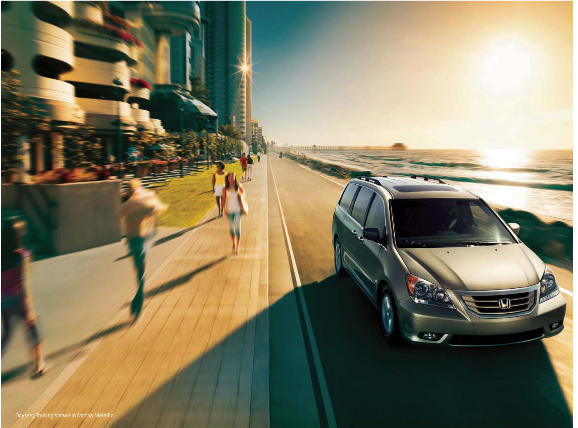
Odyssey Touring shown in Mocha Metallic.