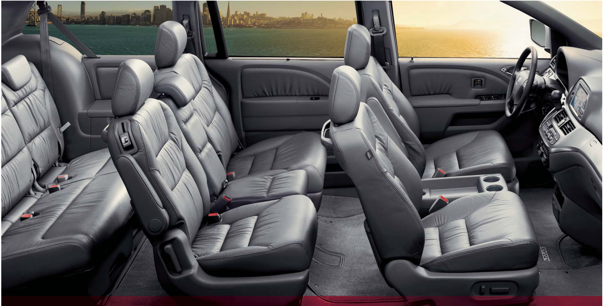
Odyssey Touring shown with Gray Leather.