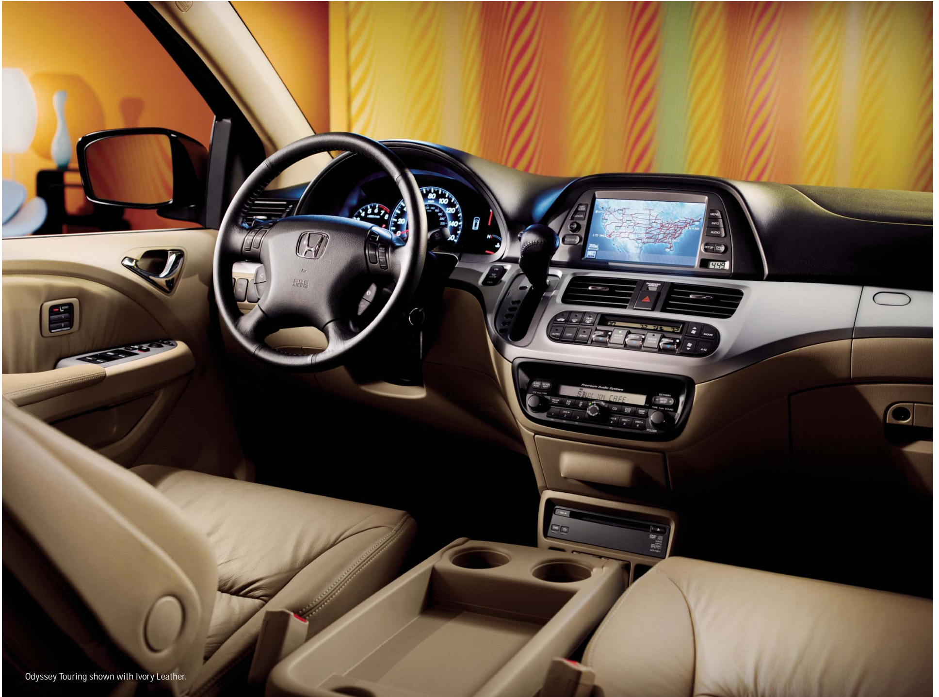
Odyssey Touring shown with Ivory Leather.