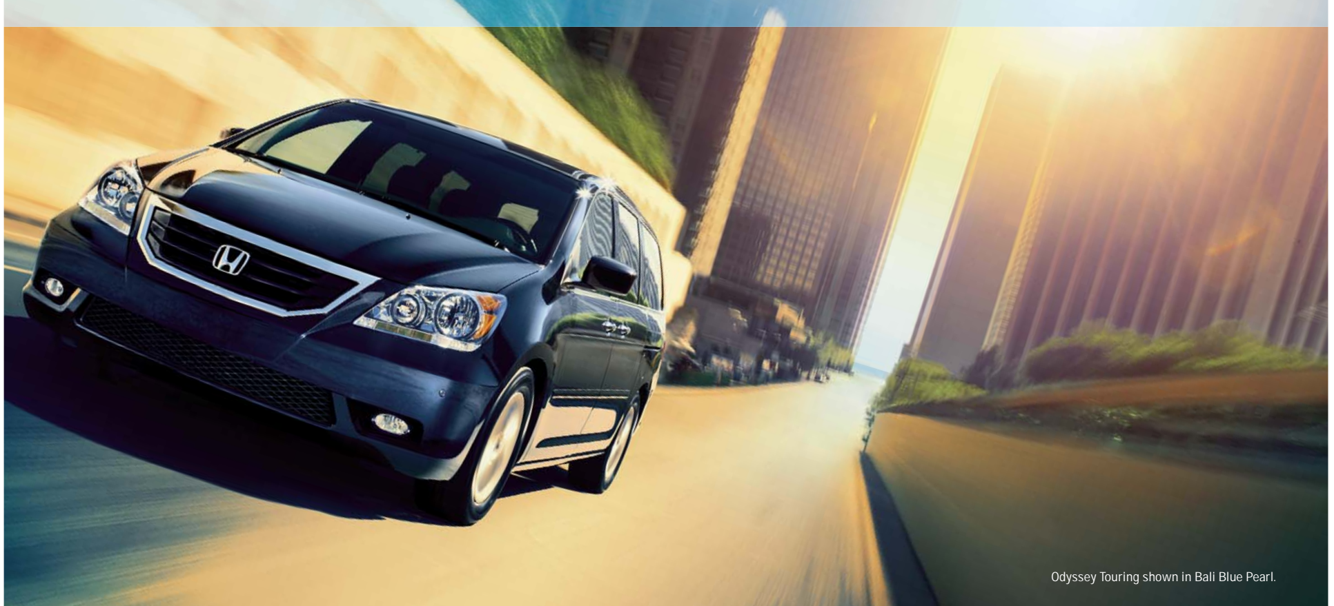
Odyssey Touring shown in Bali Blue Pearl.

know what will be until you discover what can be. dreams.honda.com