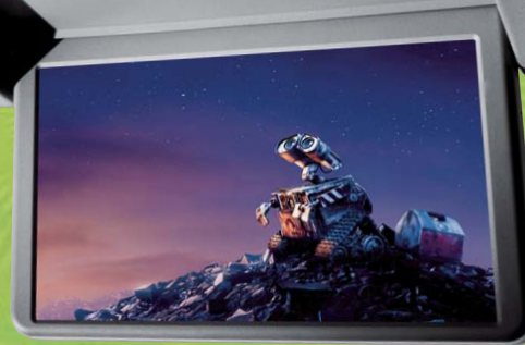
Wall-E Coming to DVD November 18.

With so many entertainment options, moments of peace, love and harmony are a whole lot easier to achieve.