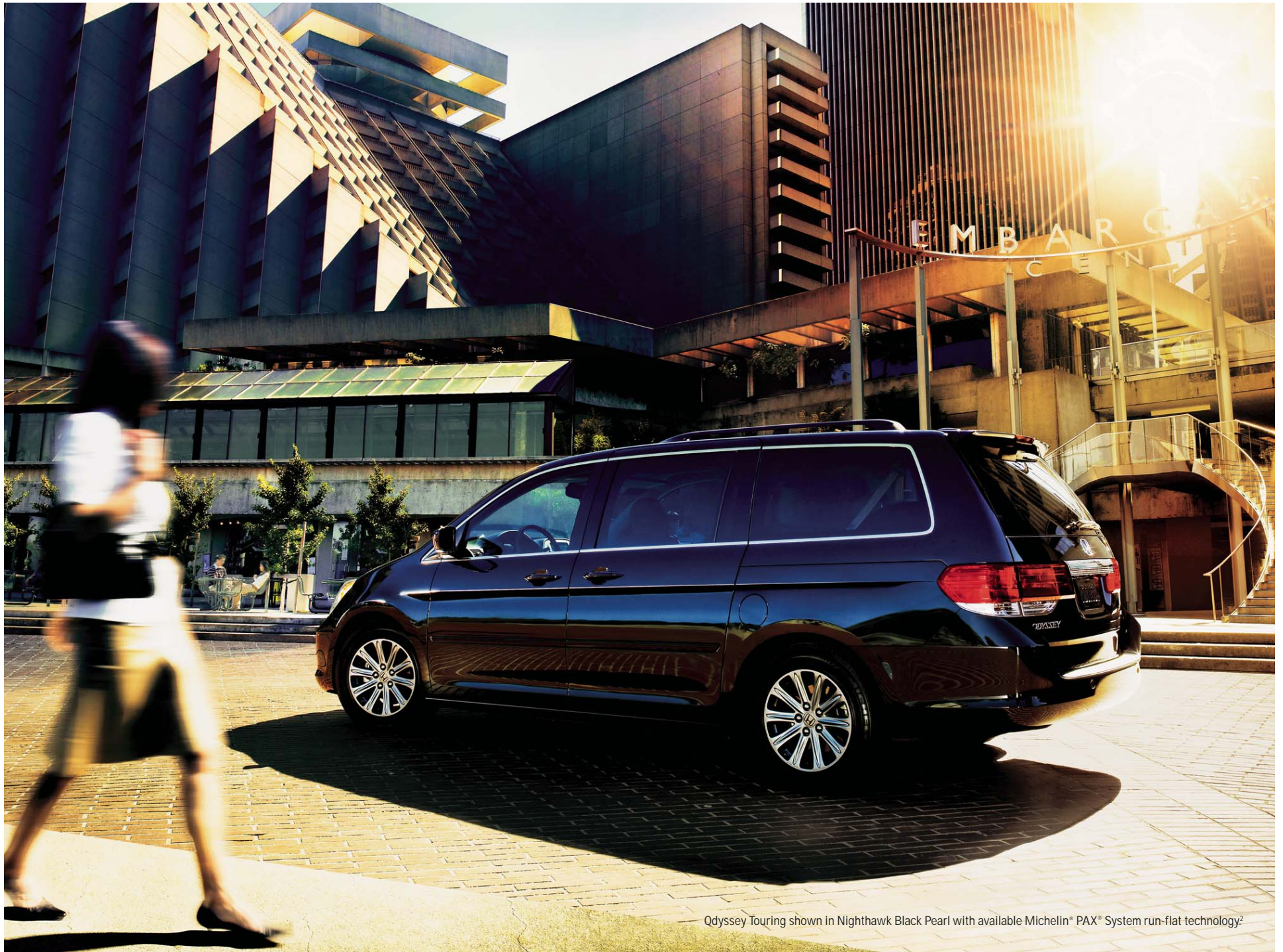
Odyssey Touring shown in Nighthawk Black Pearl with available Michelin® PAX® System run-flat technology. 2