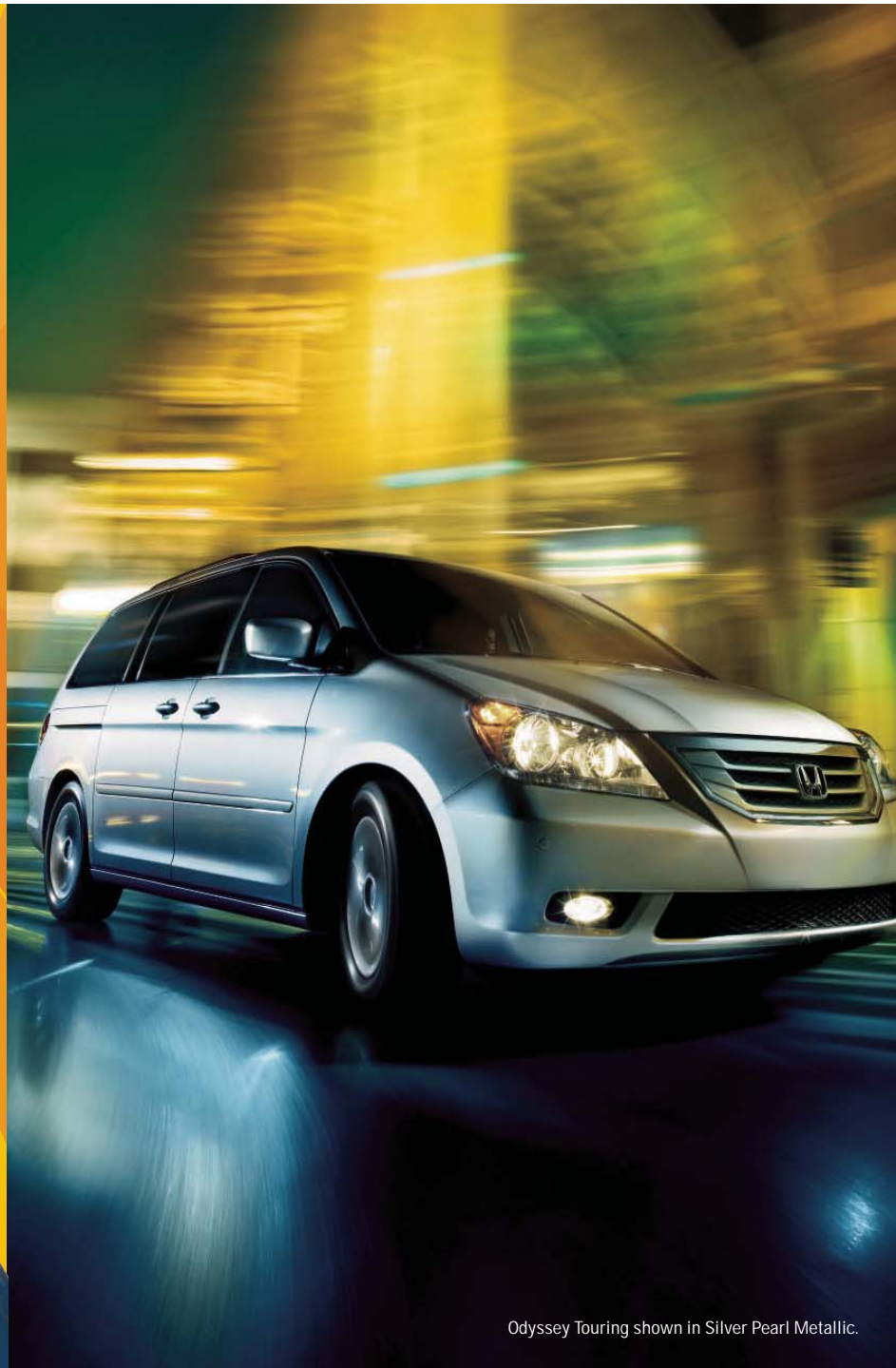
Odyssey Touring shown in Silver Pearl Metallic.