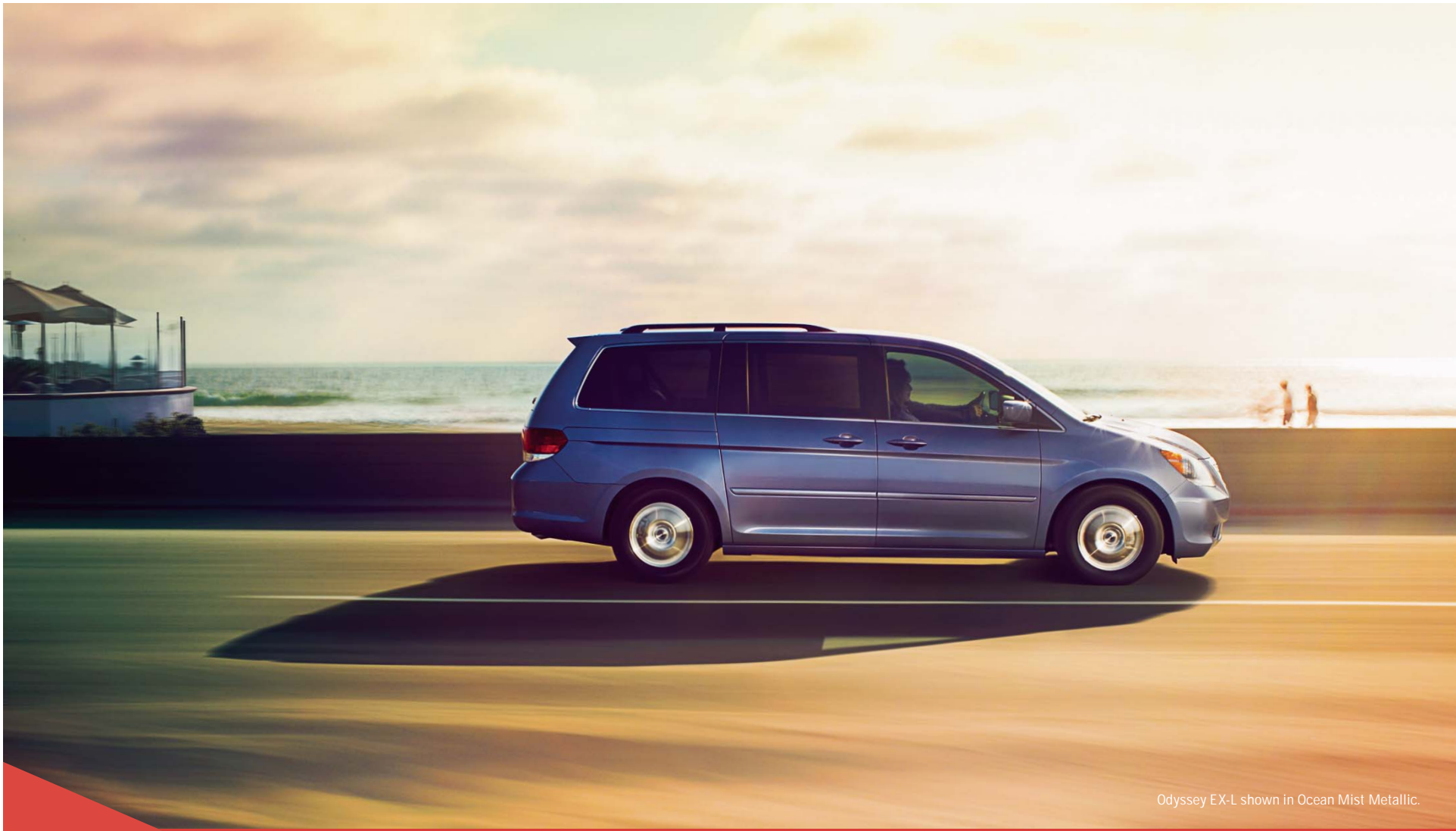
Odyssey EX-L shown in Ocean Mist Metallic.

With respect to all the things you have going on, no other van is more in sync with your life.